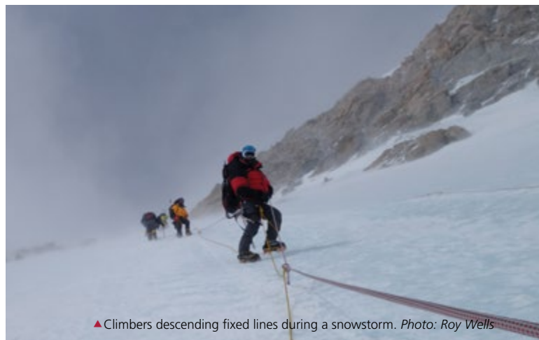
▲ Climbers descending fixed lines during a snowstorm.