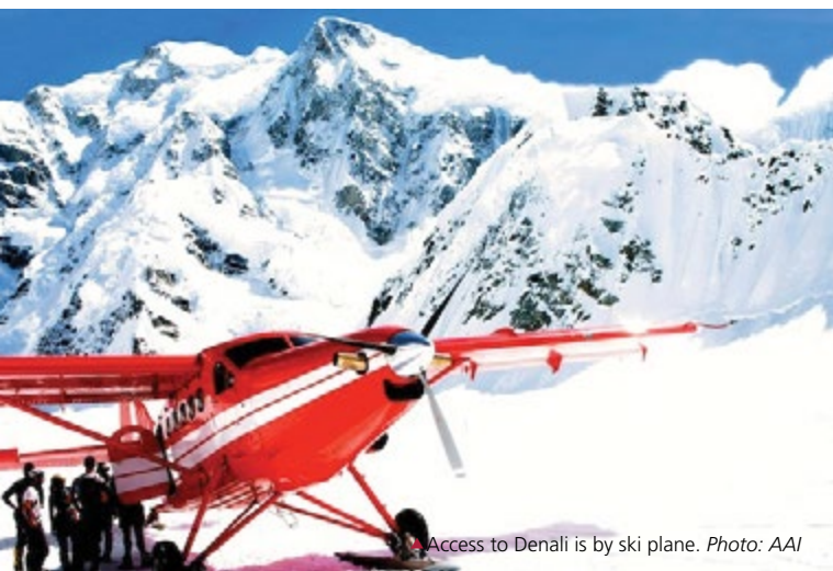
▲ Access to Denali is by ski plane.

Back carry the cache at 4,150m/13,600ft.