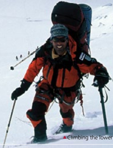
▲ Climbing the lower flanks of Denali's West Buttress Route.

Duration: 21 days Departure: Talkeetna, Alaska Price: US$11,995 per person