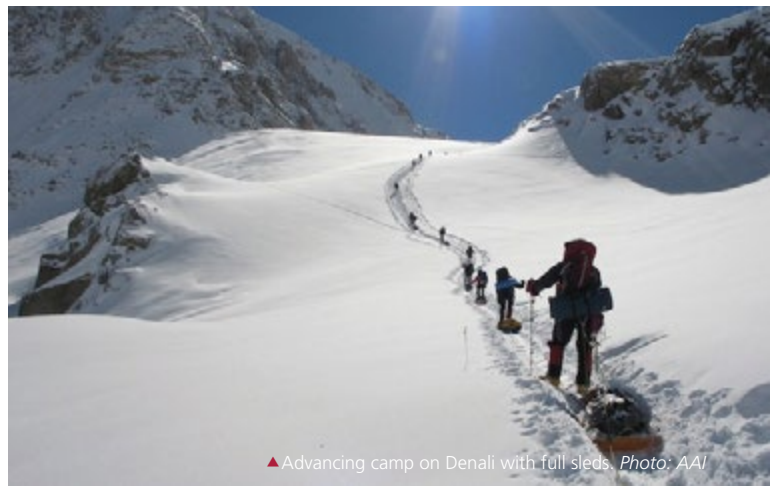
▲ Advancing camp on Denali with full sleds.

We need to be back at the landing strip by no later than 6 am on the morning of Day 21 of the trip.