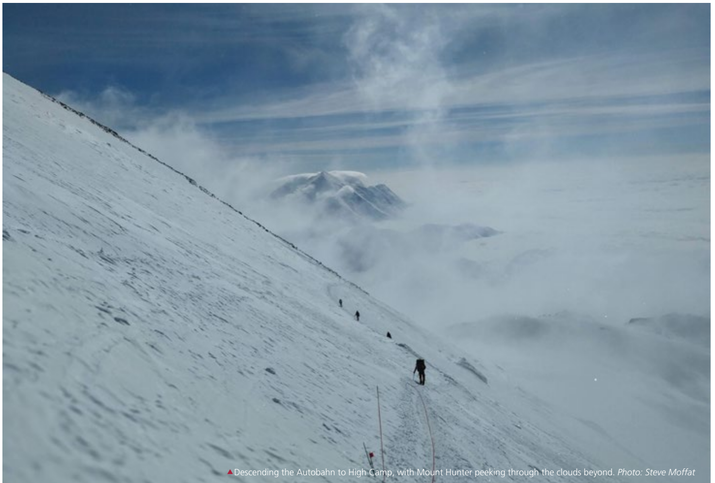
▲ Descending the Autobahn to High Camp, with Mount Hunter peeking through the clouds beyond.

Quick Stats: The descent from High Camp back to Base Camp will cover 22.5km/14mi and 3,000m/9,800ft of elevation loss. The last half-mile (800m) back to Base Camp is uphill (Heart Break Hill) and we will have to gain about 180m/600ft before reaching Base Camp.