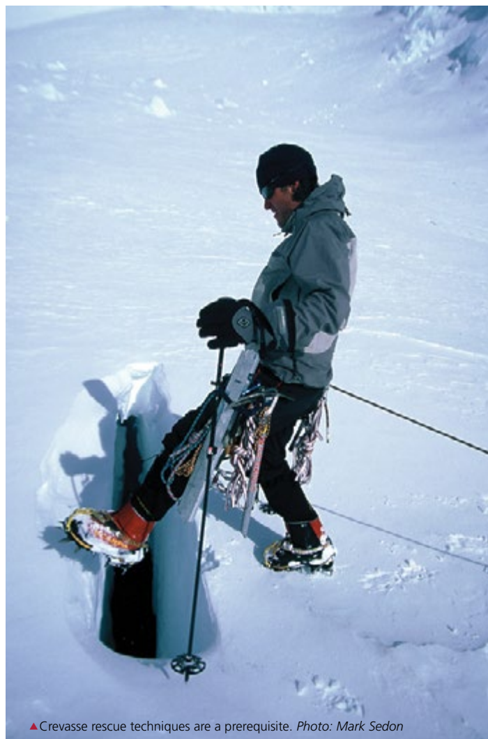
▲ Crevasse rescue techniques are a prerequisite.