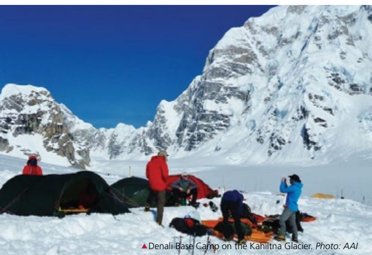
▲ Denali Base Camp on the Kahiltna Glacier.