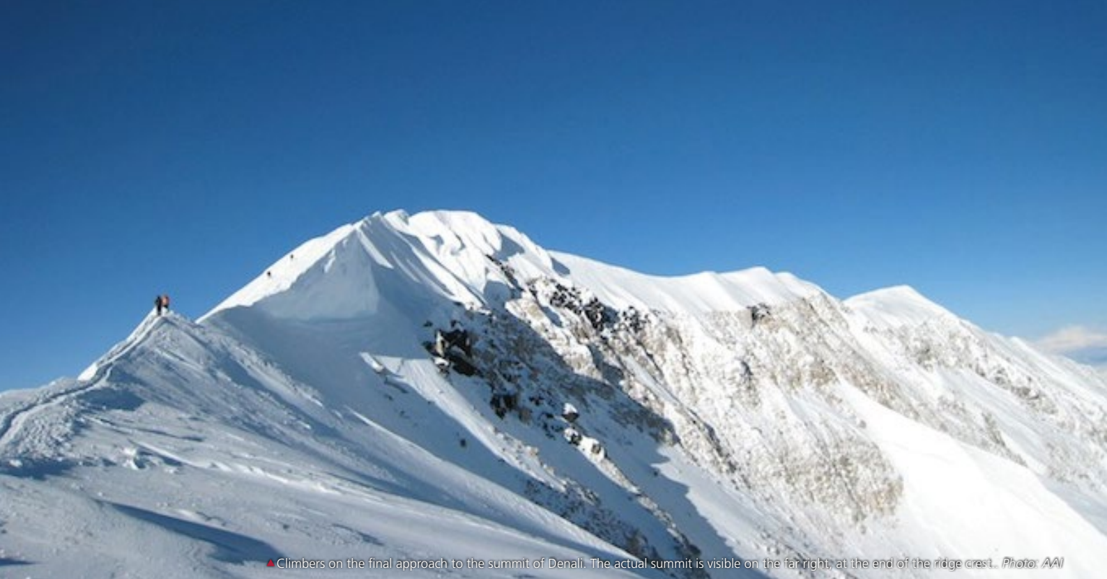
▲ Climbers on the final approach to the summit of Denali. The actual summit is visible on the far right, at the end of the ridge crest.

authorized concessionaire of Denali National Park and Preserve. All prices are subject to change without notice.