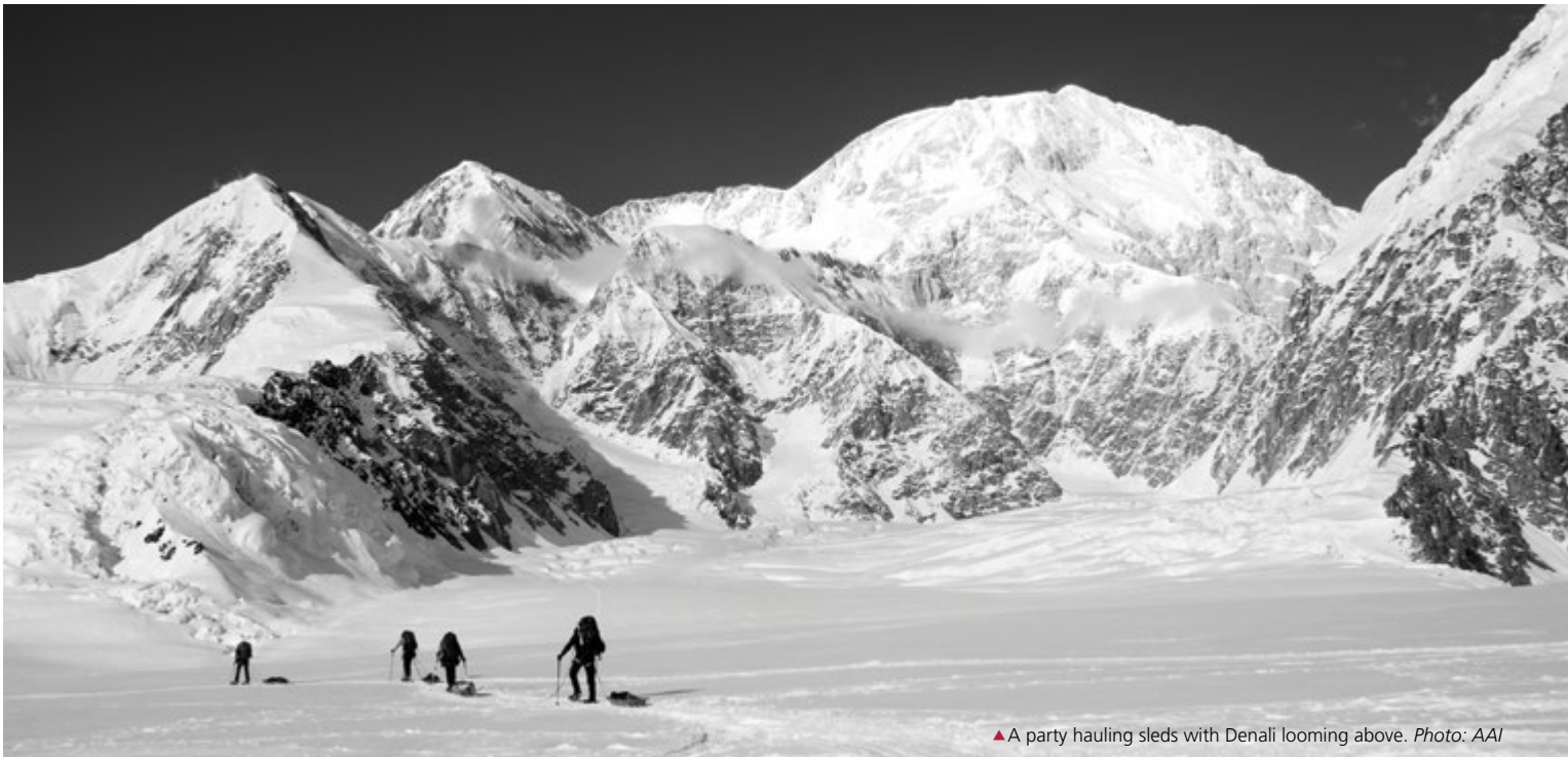
▲ A party hauling sleds with Denali looming above.

NOTE: This expedition is organised for Adventure Consultants by the American Alpine Institute, an