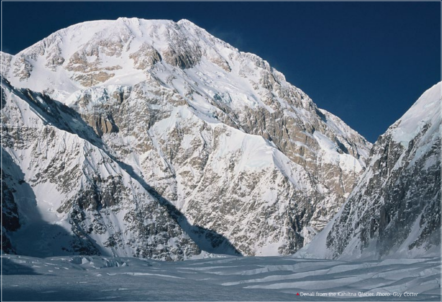
▲ Denali from the Kahiltna Glacier.