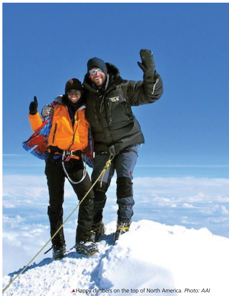
▲ Happy climbers on the top of North America.