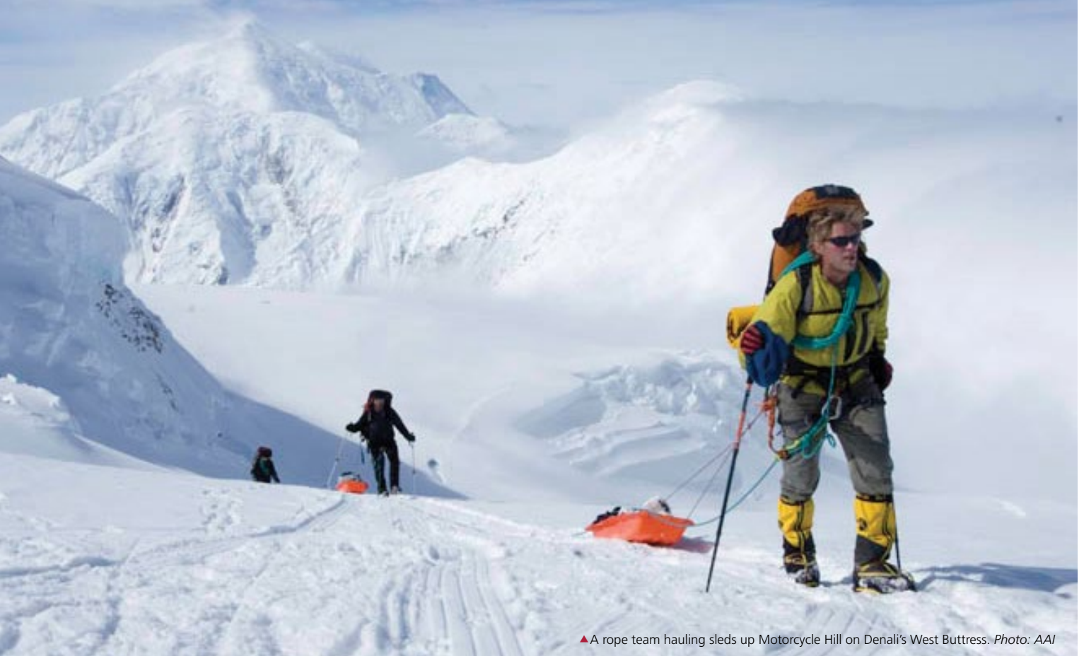
▲ A rope team hauling sleds up Motorcycle Hill on Denali's West Buttress.

The summit is never a guarantee, as Denali can experience extreme weather conditions with very cold temperatures and high winds. Storms can last a week or more, but the days can also be quite hot and clear with the long Alaskan daylight hours in the summer.