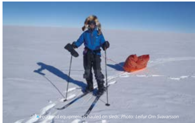
▲ Food and equipment is hauled on sleds.

Every effort will be made to ensure the expedition itinerary is adhered to, but Antarctica is the most remote and isolated continent on earth. The above program is subject to change as it may be affected by weather conditions, aircraft serviceability and other factors are out of the hands of Adventure Consultants, our staff and contractors. While every effort is made to ensure the expedition is run to schedule, acceptance onto the expedition is based on your acceptance of those conditions. Having stated that, our track record in Antarctica is impeccable, but it is a sign of our respect of Antarctica's environmental omnipotence that we alert you to those possibilities.