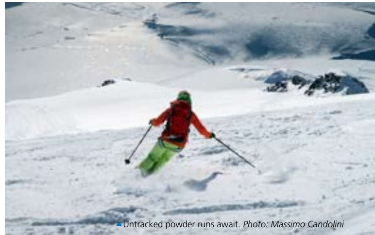
▲ Untracked powder runs await.