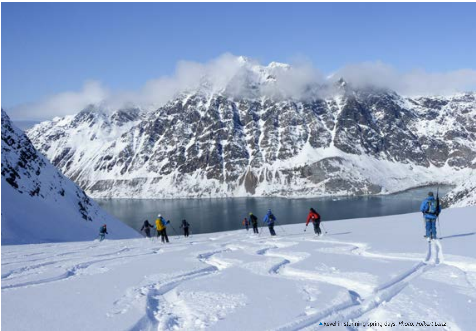
▲ Revel in stunning spring days.