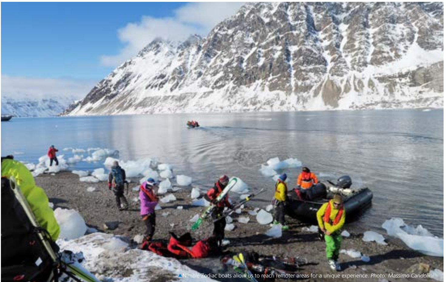
▲ Nimble Zodiac boats allow us to reach remoter areas for a unique experience.