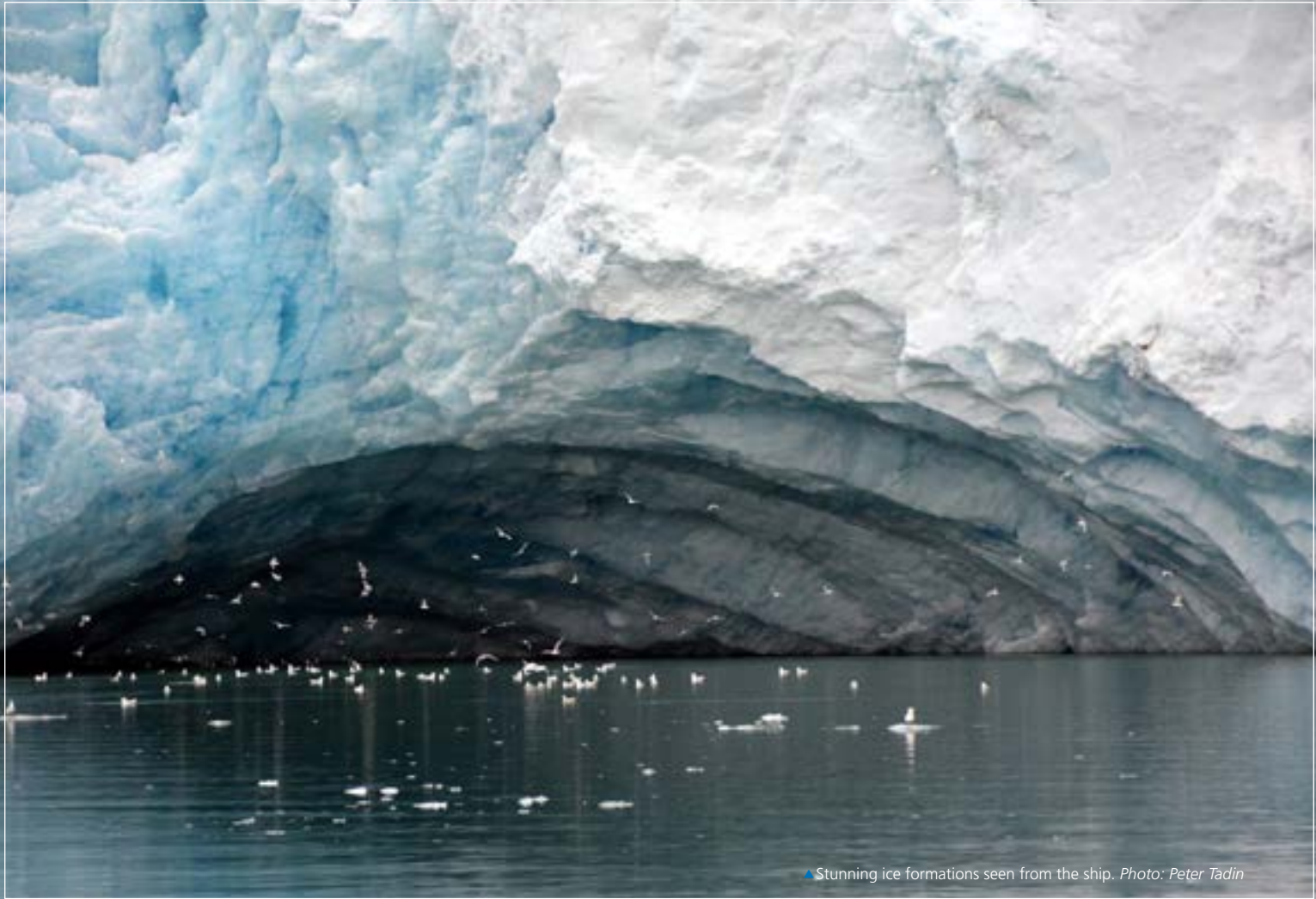
▲ Stunning ice formations seen from the ship.