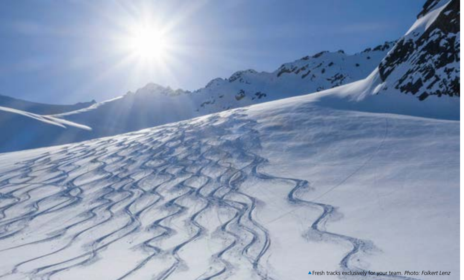
▲ Fresh tracks exclusively for your team.