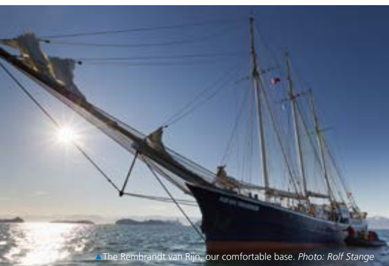
▲ The Rembrandt van Rijn, our comfortable base.