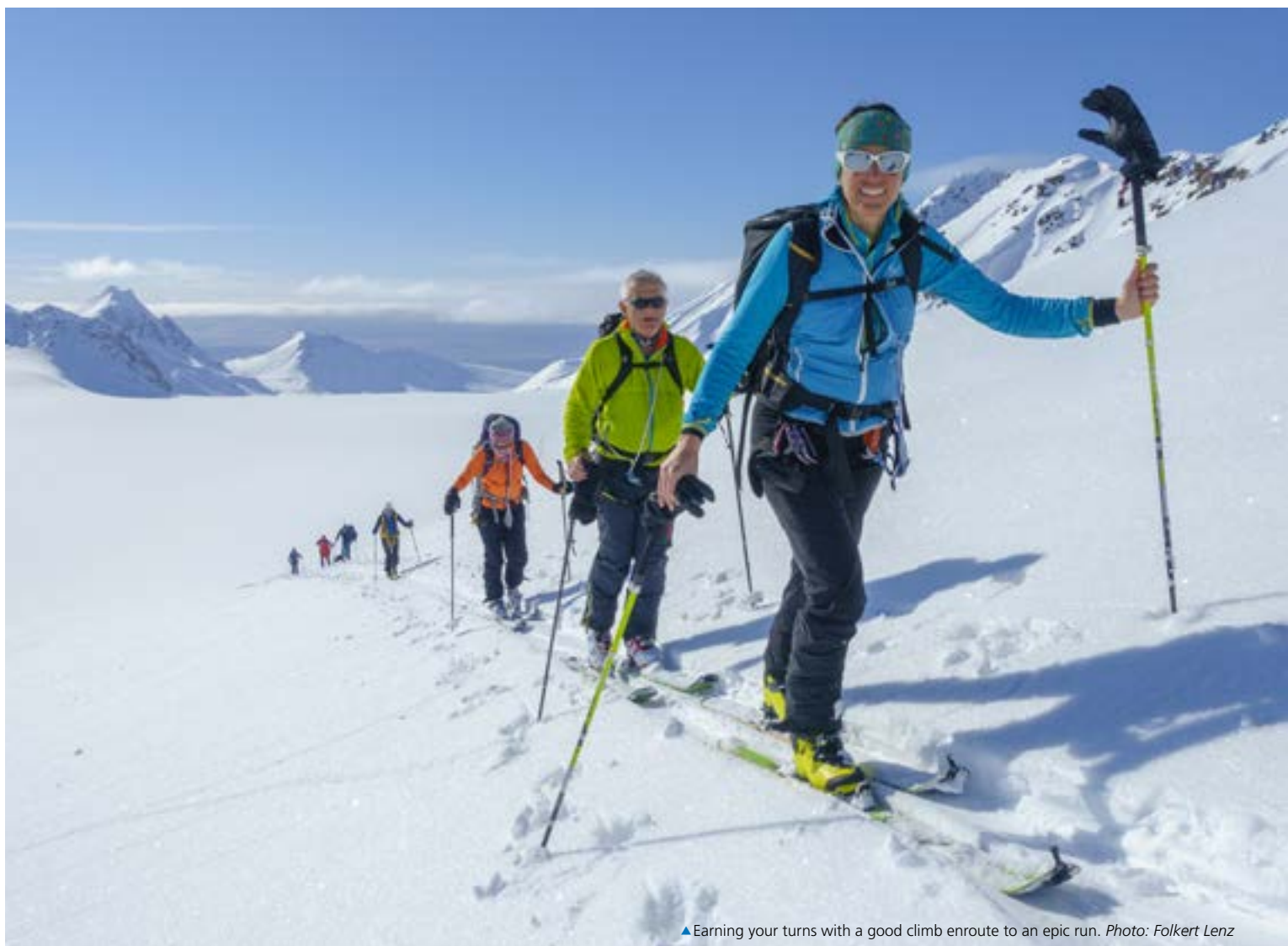
▲ Earning your turns with a good climb enroute to an epic run.