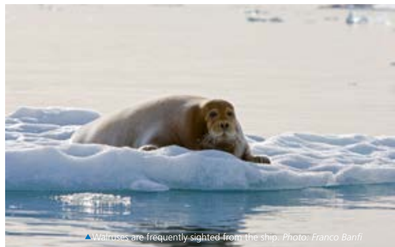
▲ Walruses are frequently sighted from the ship.