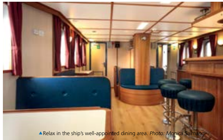
▲ Relax in the ship's well-appointed dining area.

NOTE: These prices include the Guided Backcountry Skiing option. Please deduct US$510 per person for non-skiers. Pricing may change due to increases in airfares and other costs outside the control of Adventure Consultants.