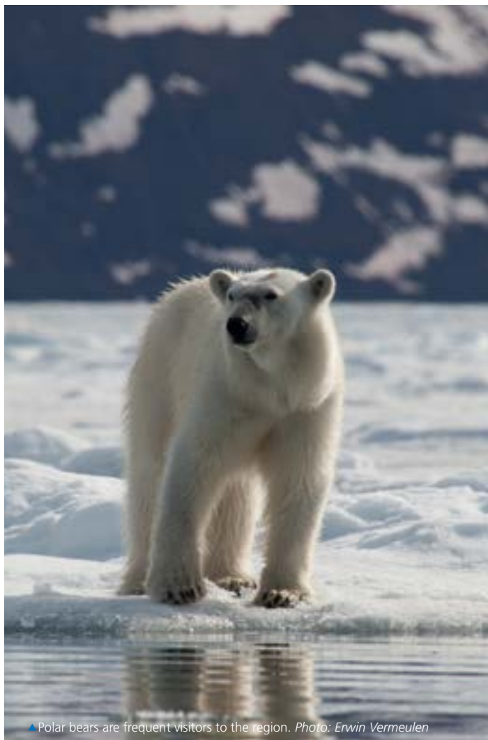
▲ Polar bears are frequent visitors to the region.

Two inflatable rubber crafts (Zodiacs) enable landing and wildlife viewing opportunities in otherwise inaccessible areas. There will be excursions on land for 3–6 hours per day over untracked area. According to conditions (weather, ice, etc.) or the passengers' wishes, the programme can sometimes be adjusted. Ample time will be devoted to wildlife, vegetation, geography and history. Our knowledgeable guides assist on these outings, providing detailed information. This is supplemented by lectures on board which cover topics such as wildlife, nature and history.