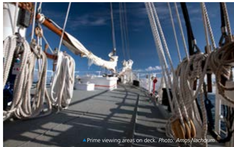
▲ Prime viewing areas on deck.