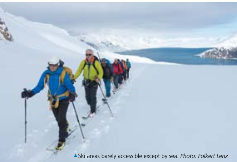
▲ Ski areas barely accessible except by sea.

Our ski mountaineering excursions from the ship allow you to explore pristine peaks and majestic mountains in a rugged fjord system. These outings will be led by experienced mountain guides and involve both skiing and mountain climbing in challenging alpine terrain.