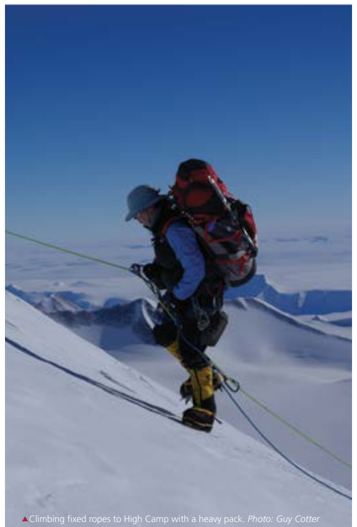
▲ Climbing fixed ropes to High Camp with a heavy pack.