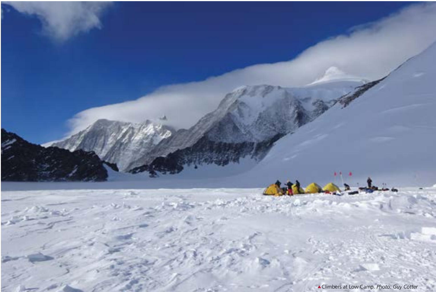
▲ Climbers at Low Camp.