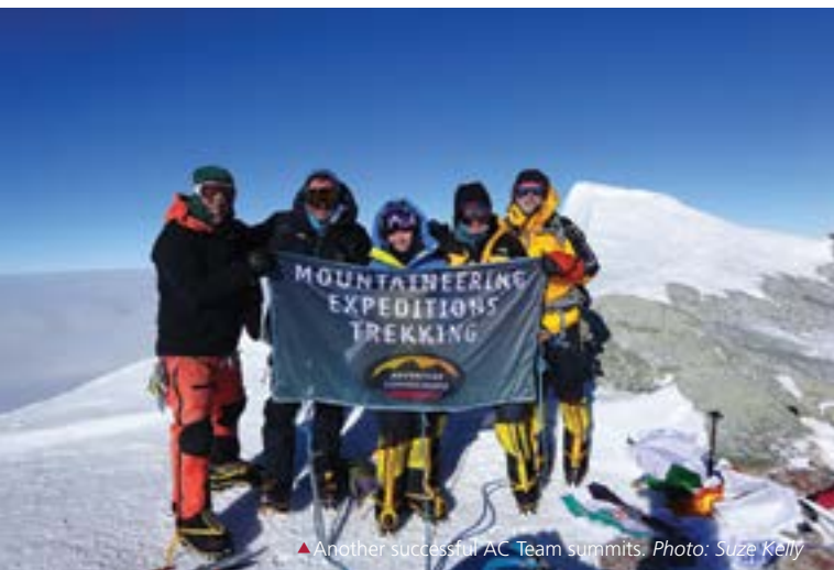
▲ Another successful AC Team summits.

Expedition members must secure their own visa for multiple-entry into Chile. While Chile claims part of the Antarctic Continent as its sovereignty, it requires that we check through immigration when leaving for and returning from Antarctica; thus a multi-entry visa is required.