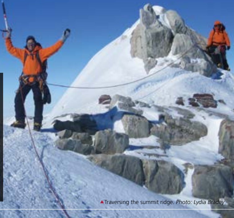
▲ Traversing the summit ridge.

Dates: Trip 1: November 23 to December 8, 2021 (experience the total solar eclipse!) Trip 2: December 4–19, 2021 Trip 3: December 15–30, 2021 Trip 4: December 26, 2021 to January 10, 2022 Trip 5: January 6–21, 2022 Duration: 16 days Departure: ex Punta Arenas, Chile Price: US$44,250 per person