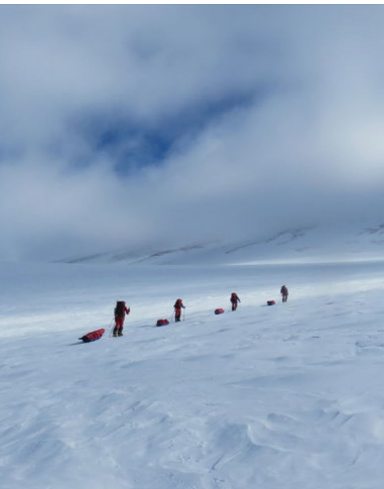
▲ Climbers haul sleds towards High Camp.