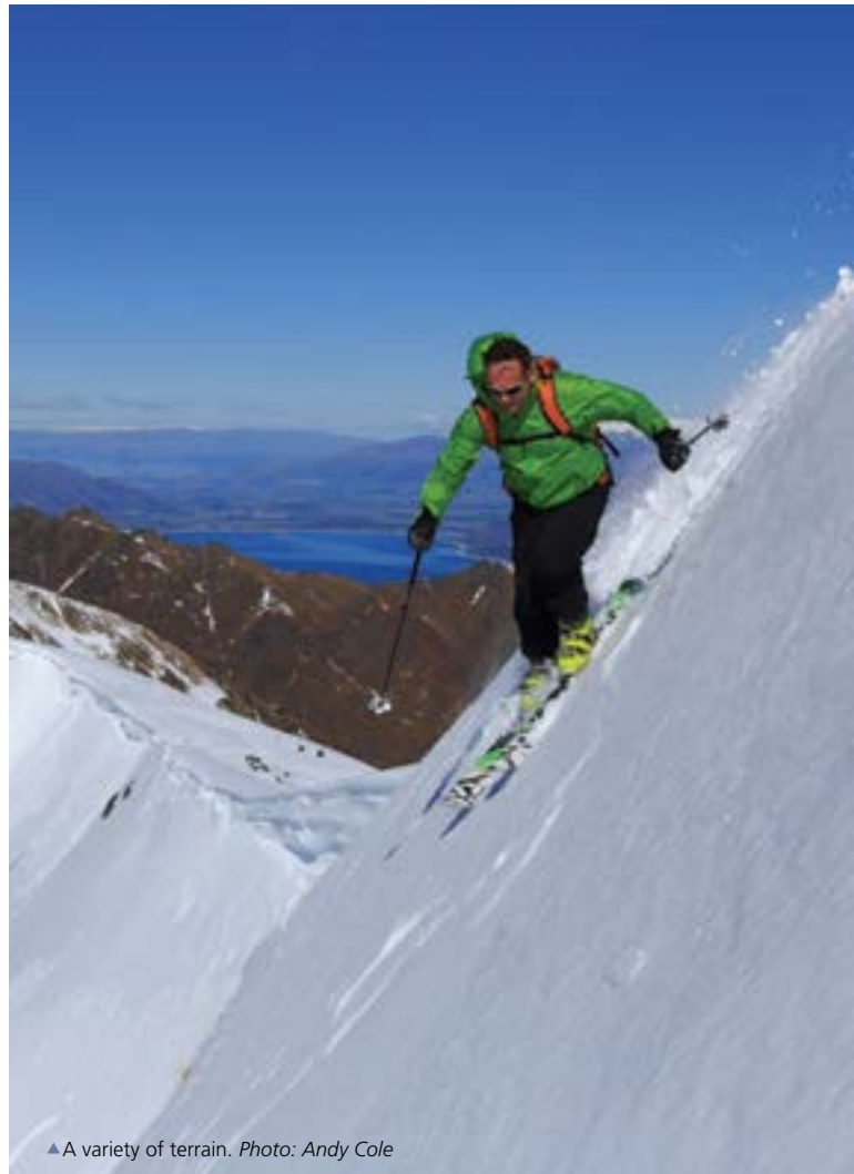
▲ A variety of terrain.