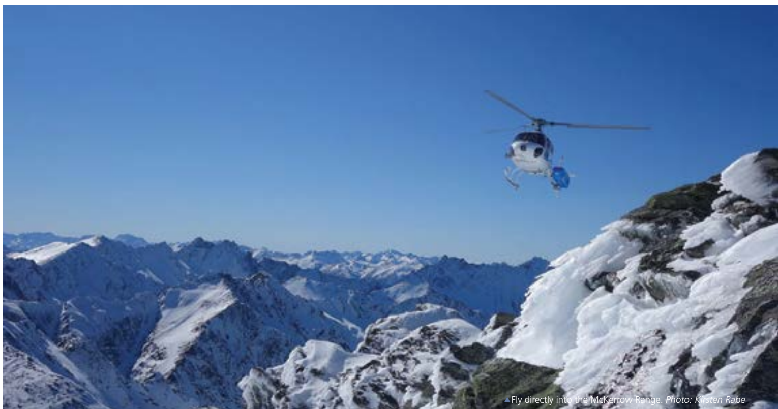
▲ Fly directly into the McKerrow Range.

NOTE: All prices are subject to change without notice.