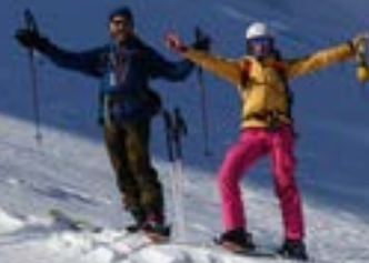
▲ Escape the crowds.

Heli-Accessed Ski Touring allows you the opportunity to ski tour in Wanaka's premier mountain terrain. A morning helicopter ride will deliver you to a remote mountain top, from where you can enjoy a day of ski touring on high alpine terrain with your friendly and highly qualified ski guides.