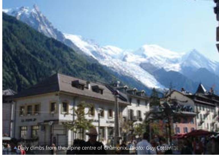
▲ Daily climbs from the alpine centre of Chamonix.