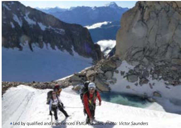
▲ Led by qualified and experienced IFMGA Guides.

For the account of Adventure Consultants Limited