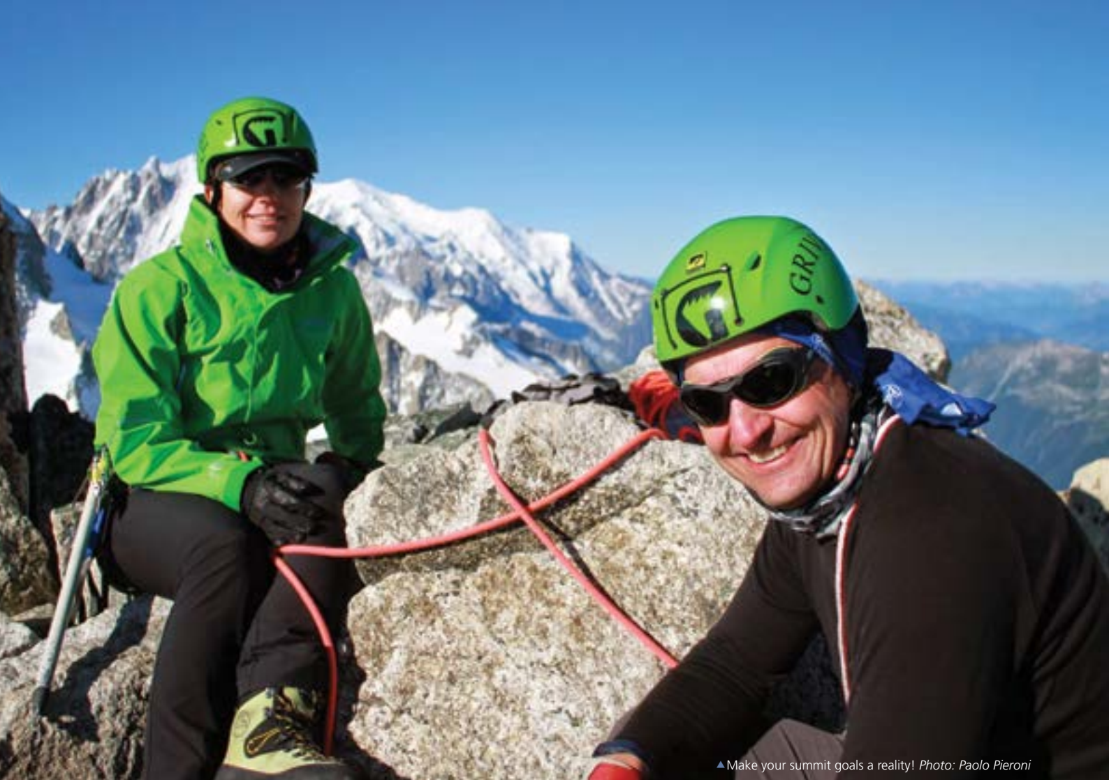
▲ Make your summit goals a reality!

We recommend you take out trip cancellation insurance via your travel agent if you wish to be covered against cancellation due to medical or personal reasons.