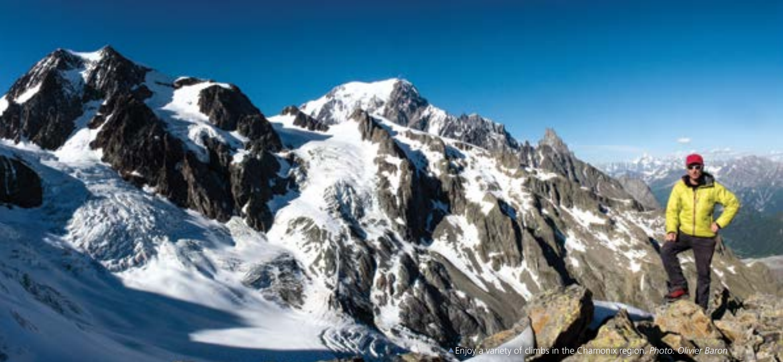
▲ Enjoy a variety of climbs in the Chamonix region.