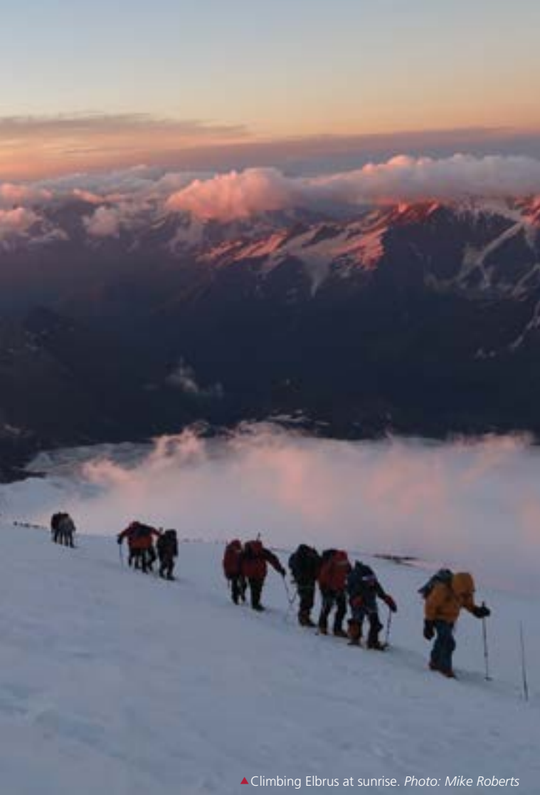
▲ Climbing Elbrus at sunrise.