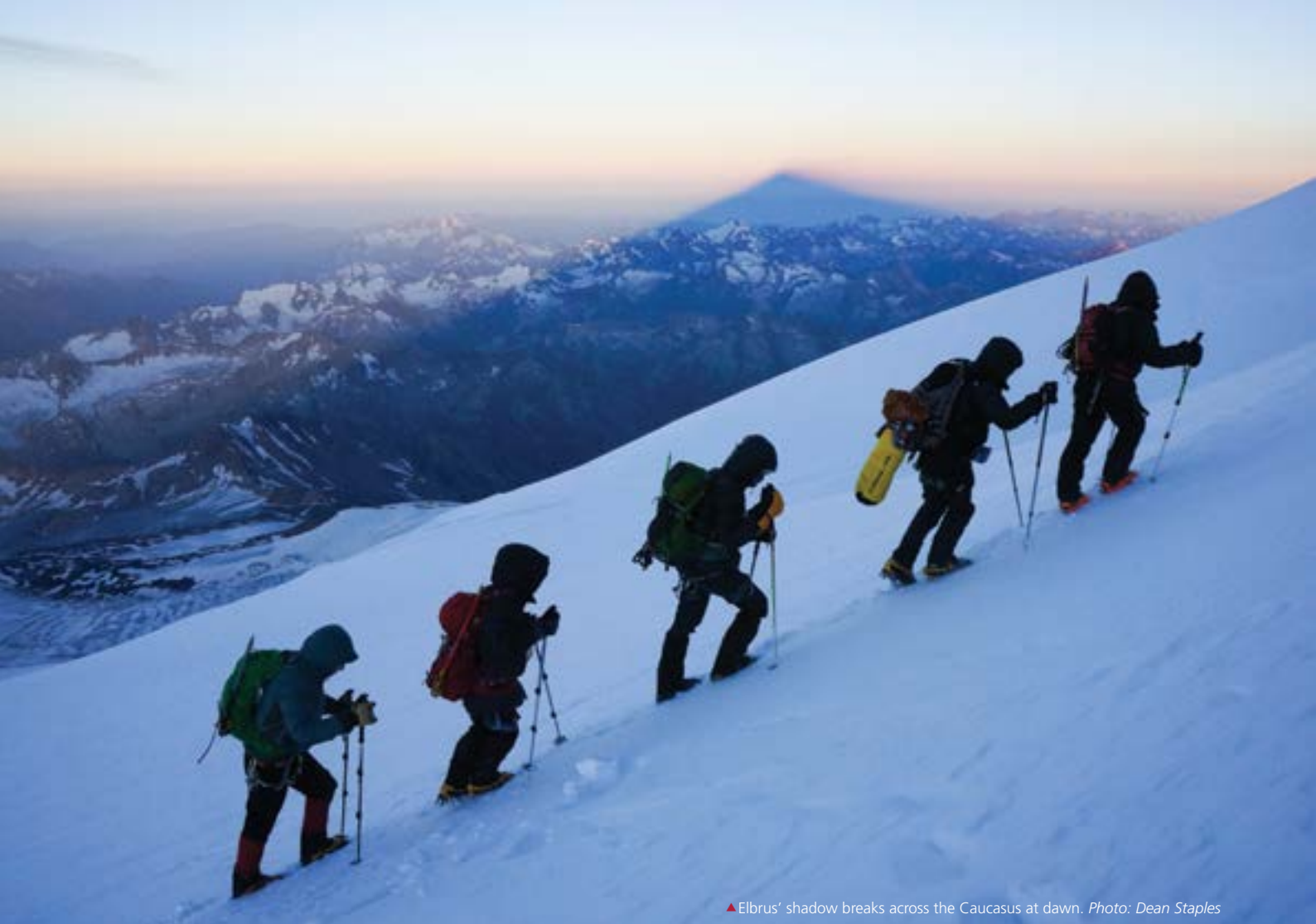
▲ Elbrus' shadow breaks across the Caucasus at dawn.