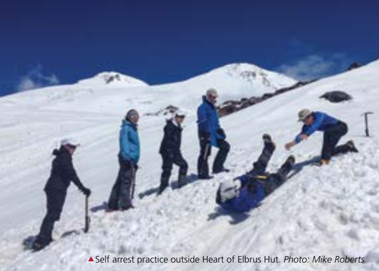
▲ Self arrest practice outside Heart of Elbrus Hut.