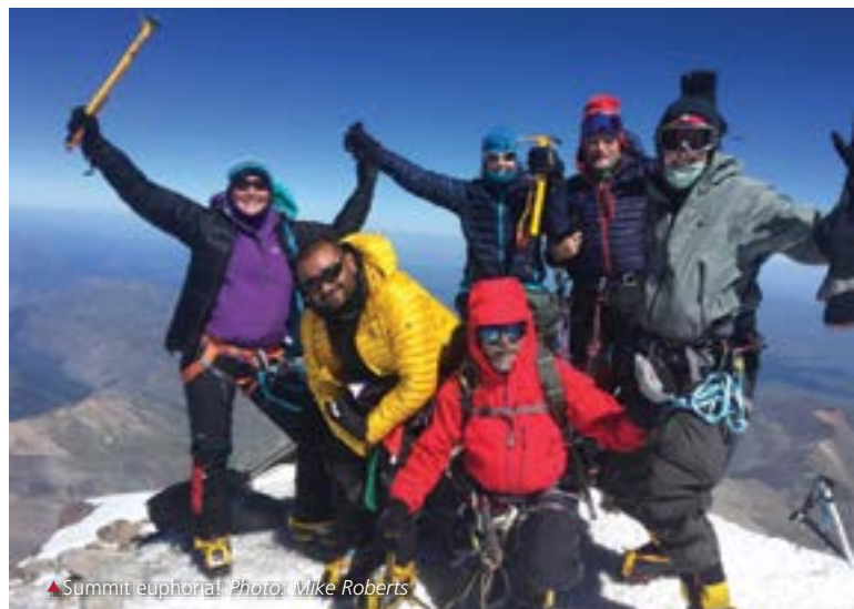
▲ Summit euphoria!