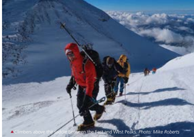
▲ Climbers above the saddle between the East and West Peaks.