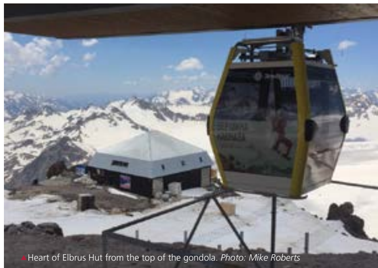
▲ Heart of Elbrus Hut from the top of the gondola.

NOTE: We also operate a shorter 11-day Elbrus Trip 2 initiating in Moscow and concluding in Mineralnye Vody between July 20–30, 2020 and a 10-day Elbrus Trip 3 that begins and finishes in Mineralnye Vody between August 8–17, 2020.