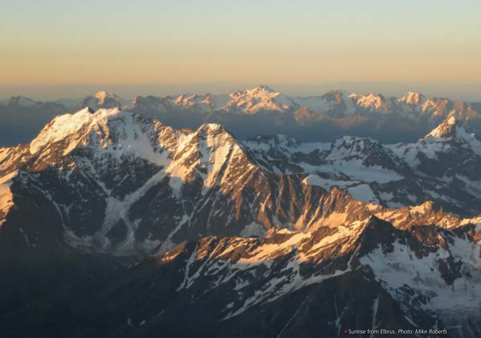
▲ Sunrise from Elbrus.