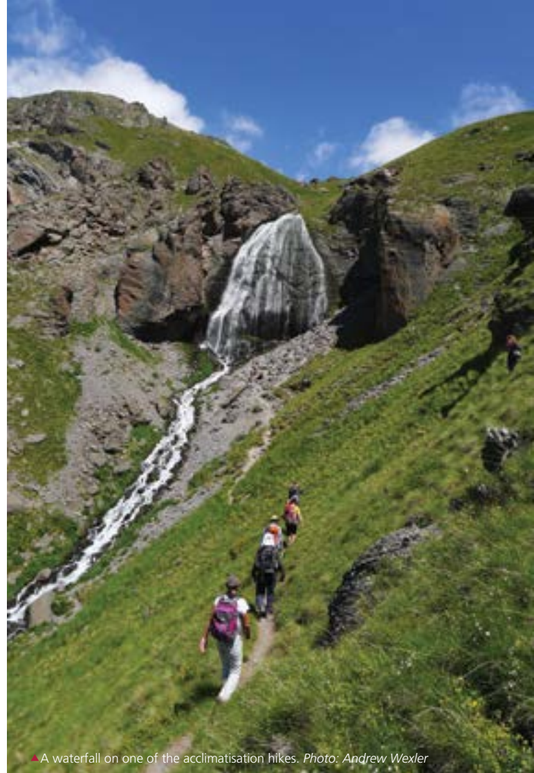
▲ A waterfall on one of the acclimatisation hikes.