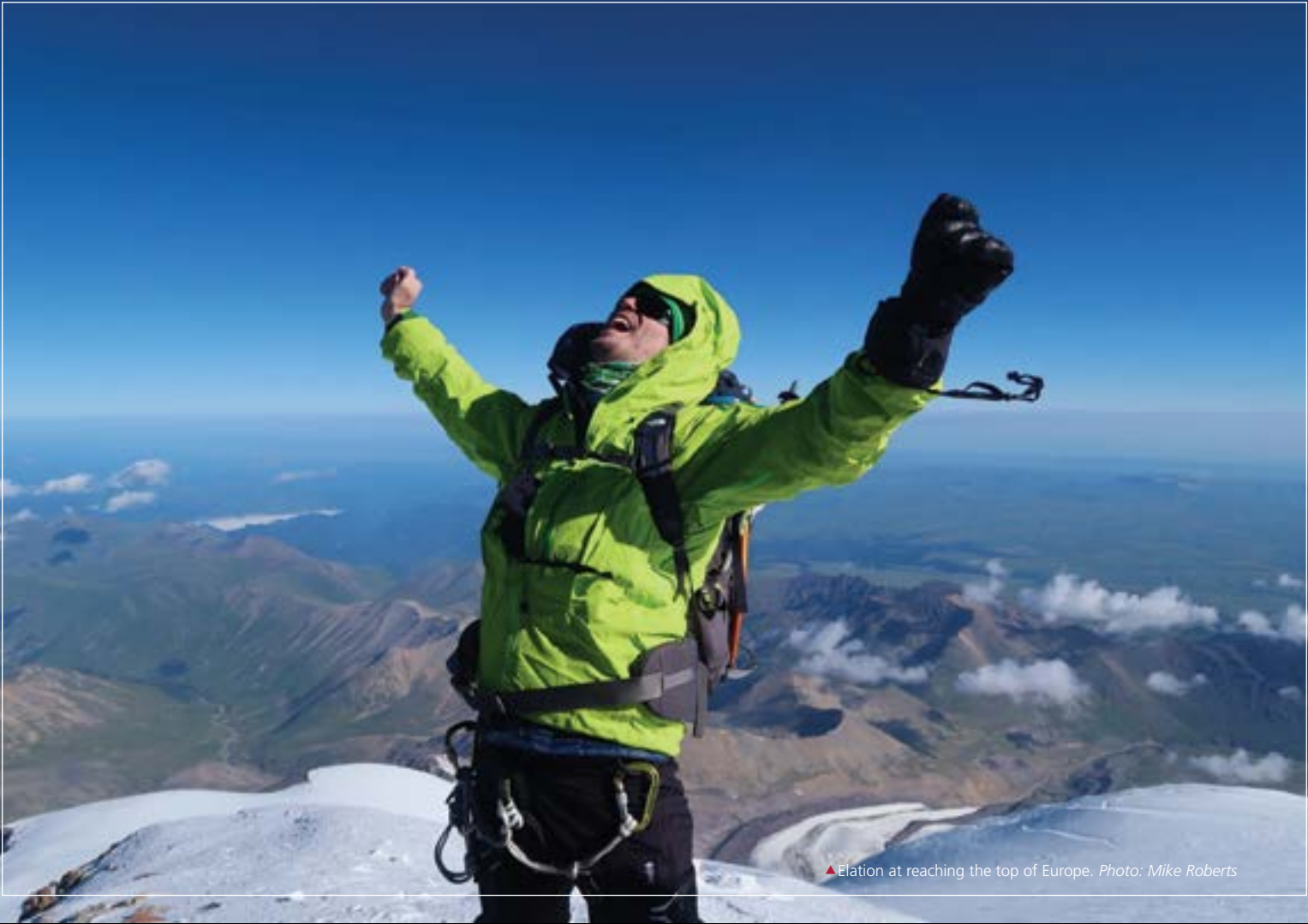
▲ Elation at reaching the top of Europe.