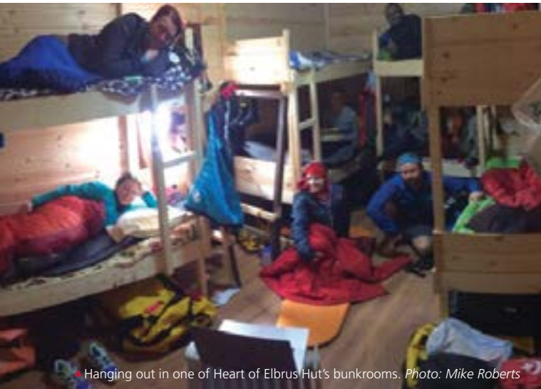
◆ Hanging out in one of Heart of Elbrus Hut's bunkrooms.