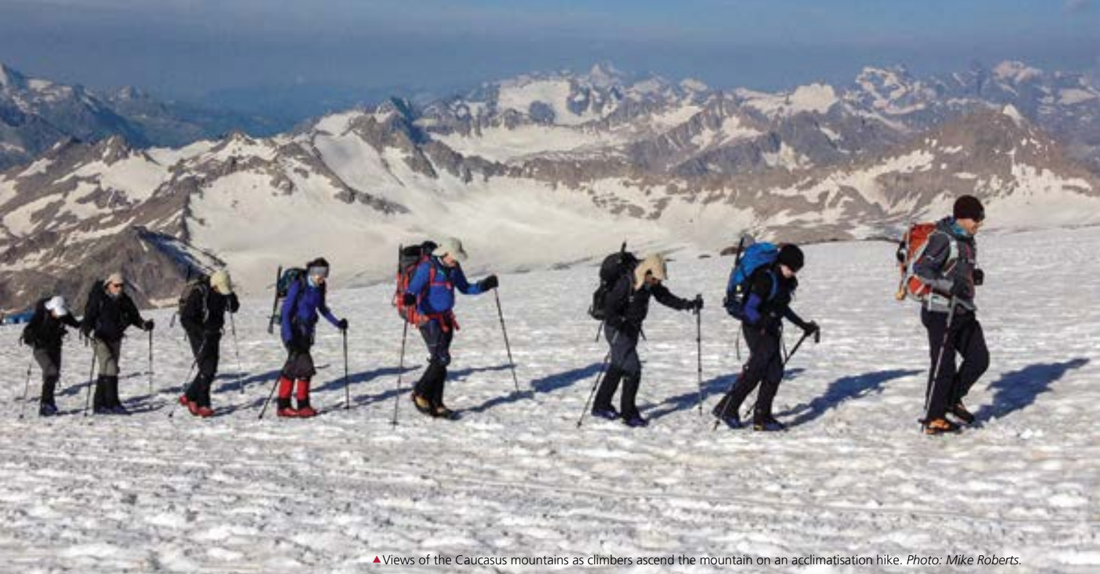
▲Views of the Caucasus mountains as climbers ascend the mountain on an acclimatisation hike.