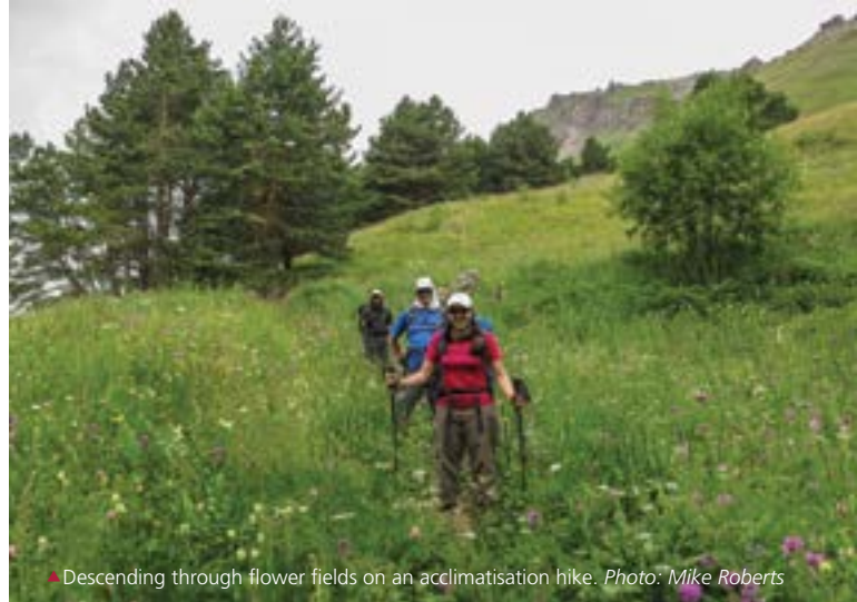
▲ Descending through flower fields on an acclimatisation hike.