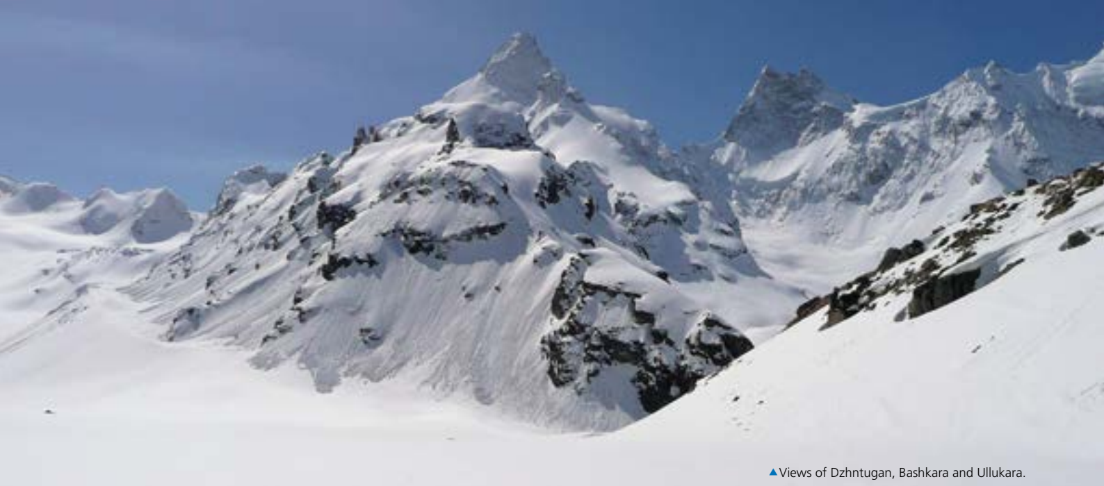
▲ Views of Dzhntugan, Bashkara and Ullukara.