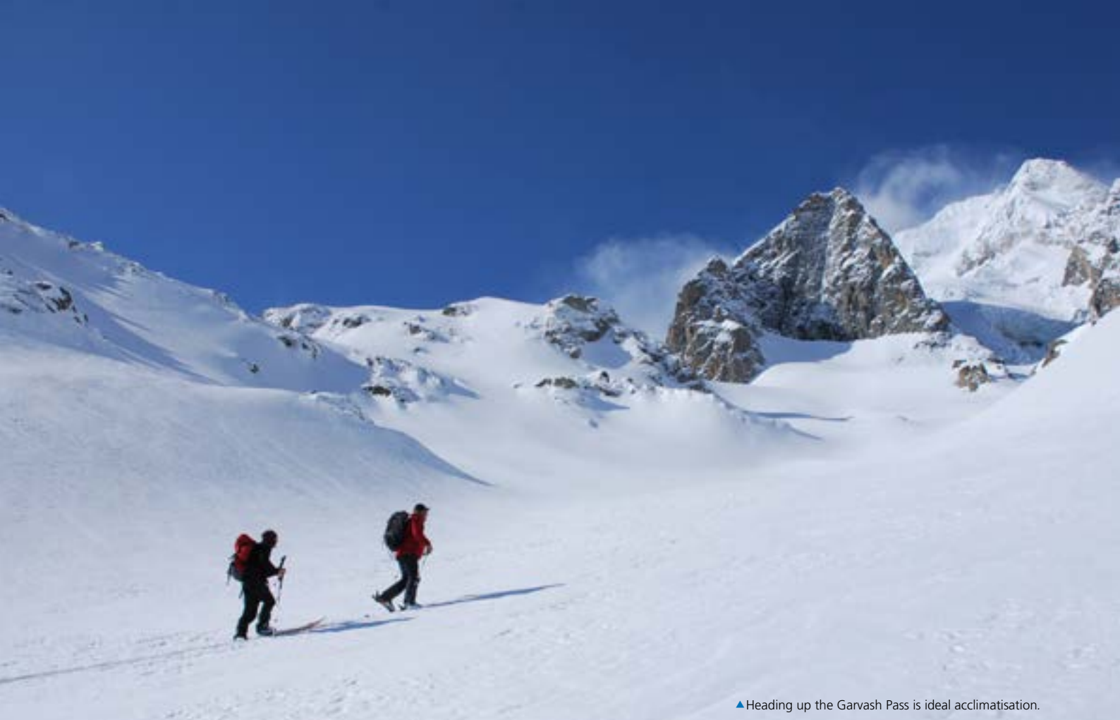
▲ Heading up the Garvash Pass is ideal acclimatisation.

Throughout our program we stay in hotels, lodges and huts to avoid the need for camping, so you can simply bring along a sleeping bag and your ski gear and enjoy the trip!