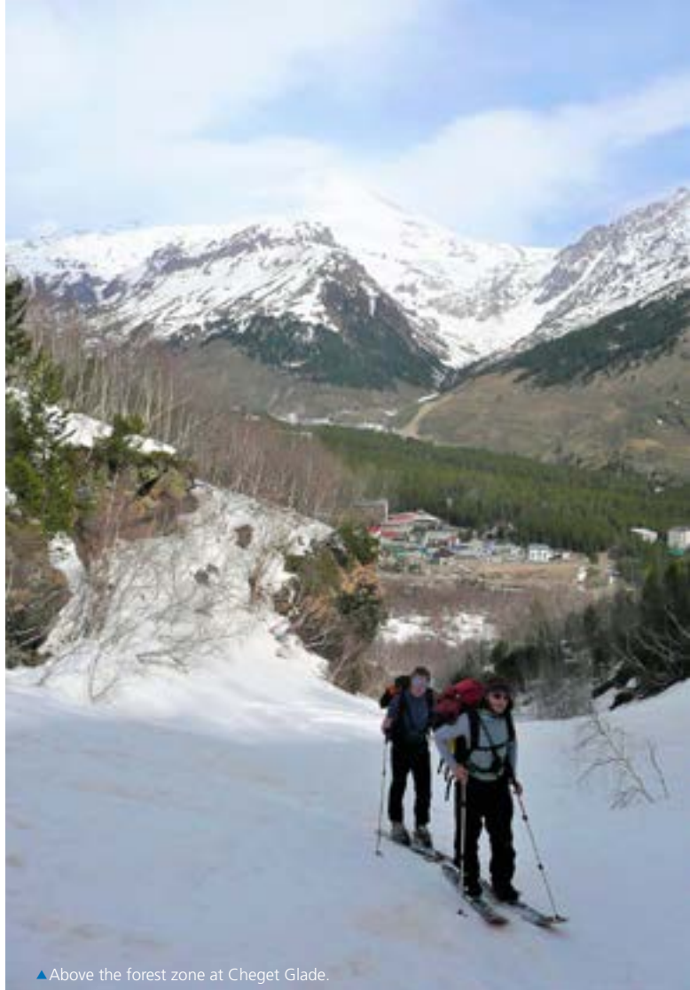
▲ Above the forest zone at Cheget Glade.