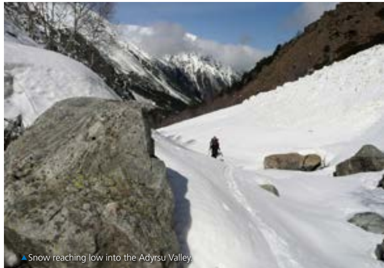
▲ Snow reaching low into the Adyrsu Valley.