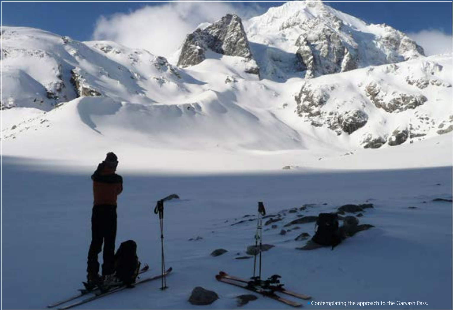
Contemplating the approach to the Garvash Pass.