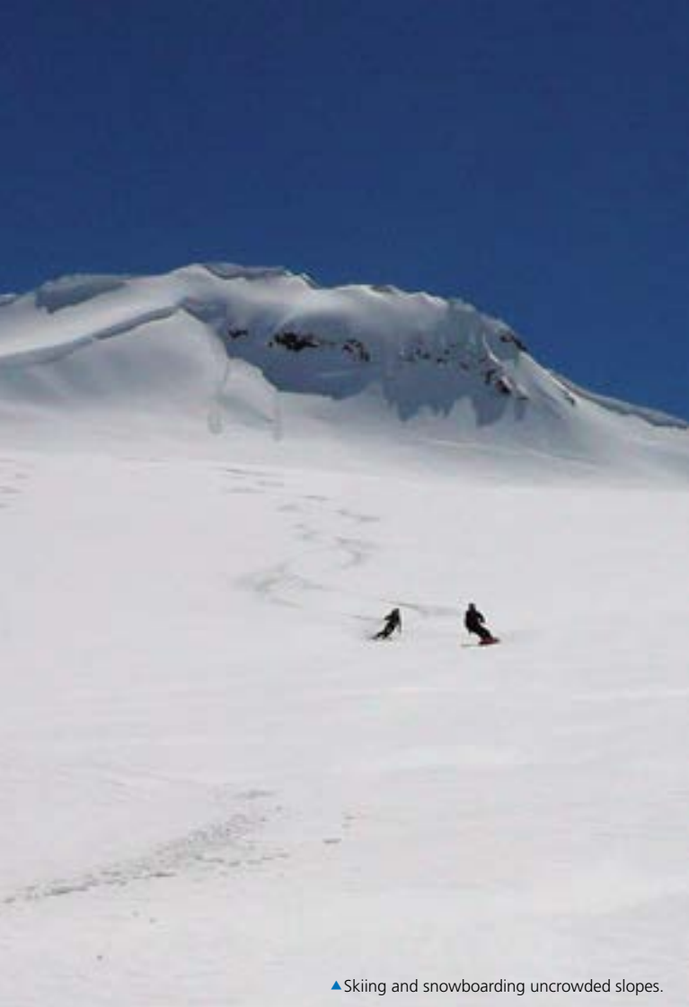
▲ Skiing and snowboarding uncrowded slopes.