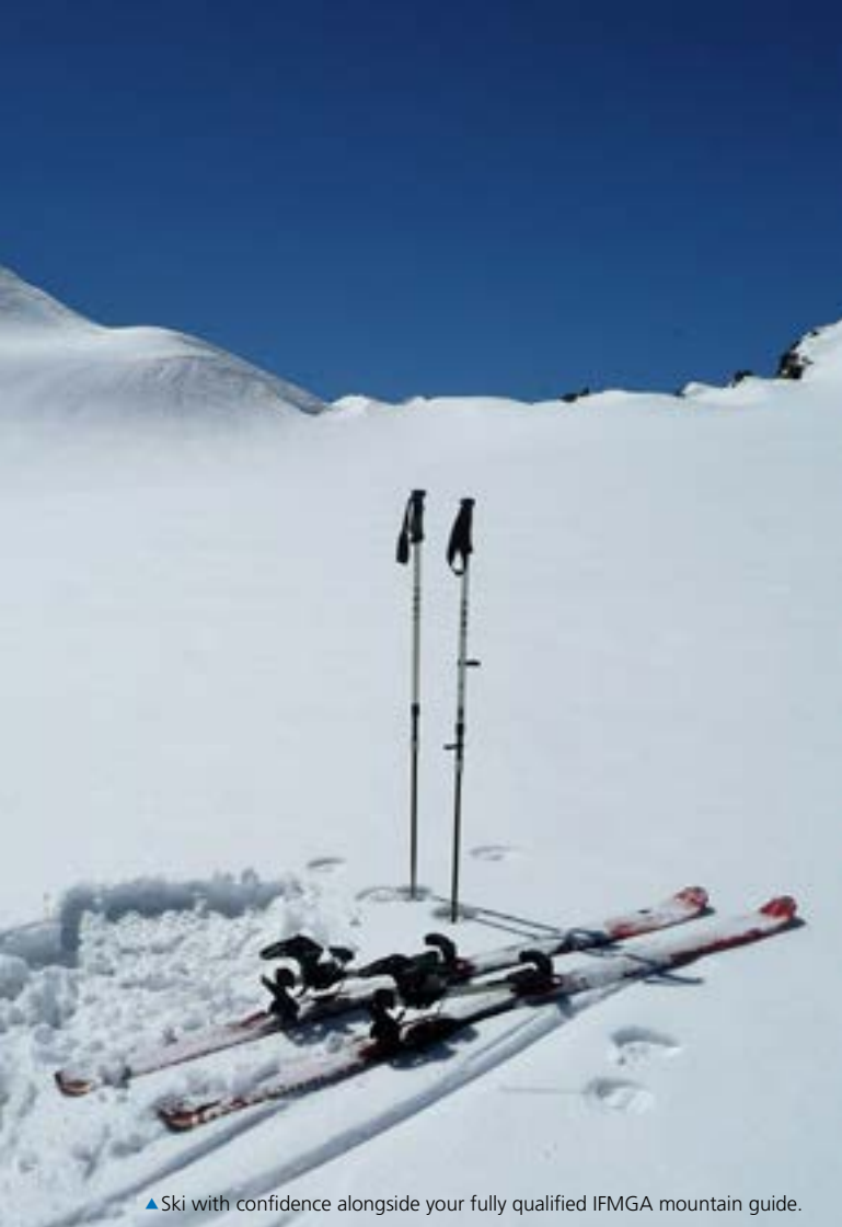
▲ Ski with confidence alongside your fully qualified IFMGA mountain guide.