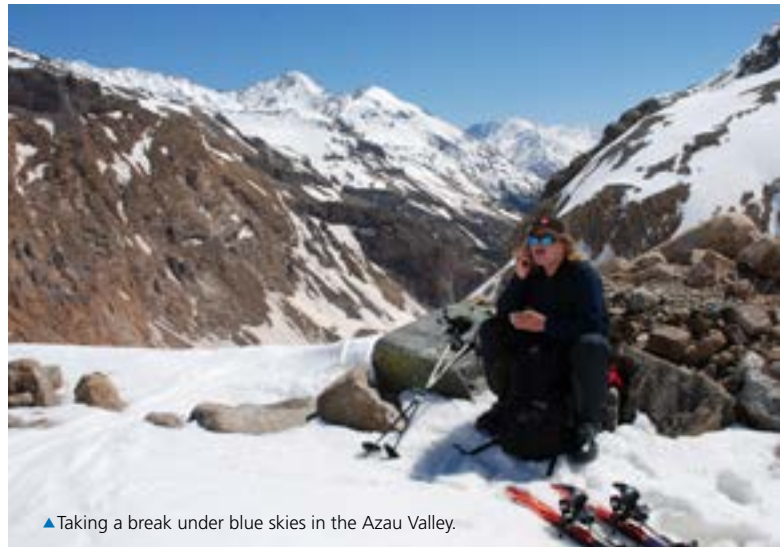
▲ Taking a break under blue skies in the Azau Valley.