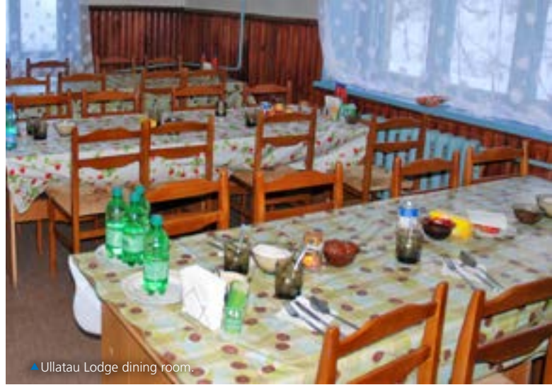
▲ Ullatau Lodge dining room.