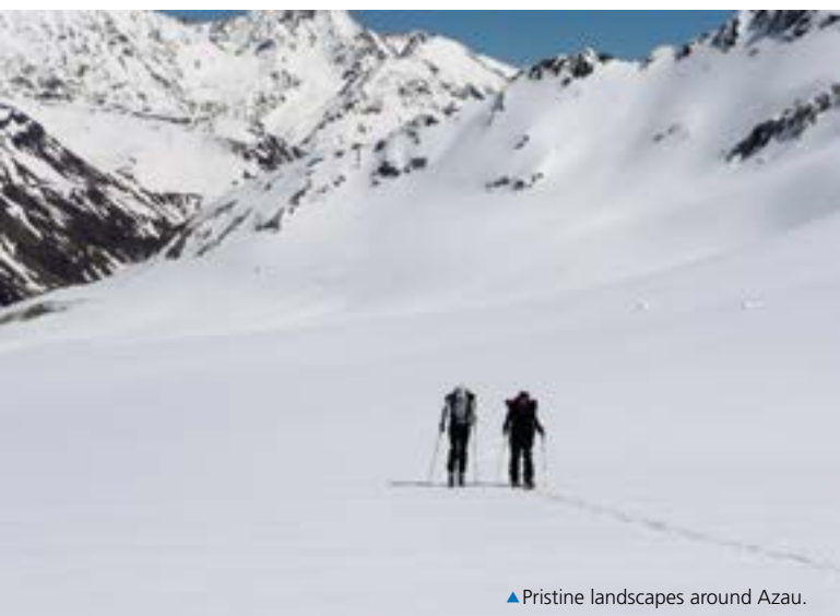
▲ Pristine landscapes around Azau.