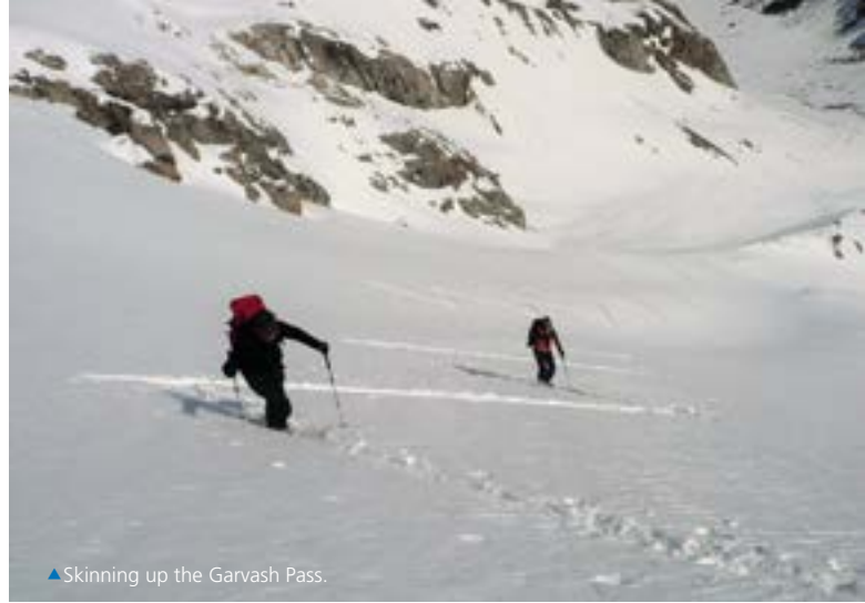
▲ Skinning up the Garvash Pass.