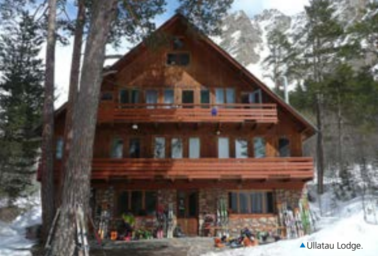
▲ Ullatau Lodge.