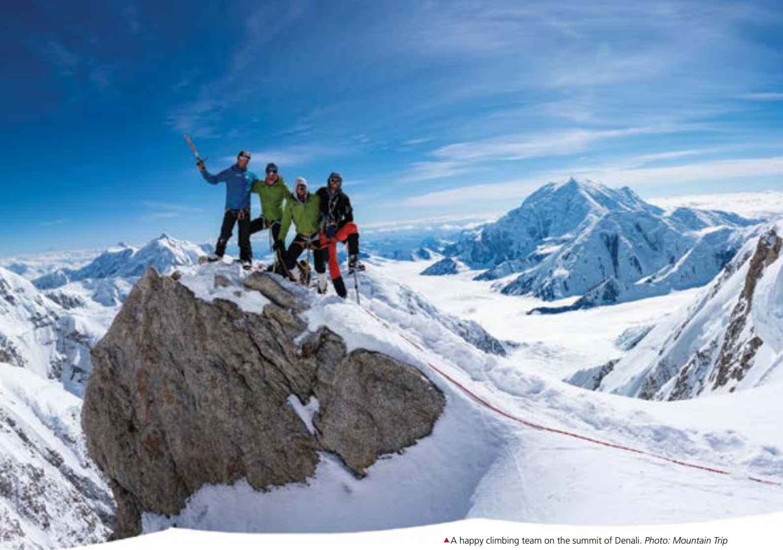
▲ A happy climbing team on the summit of Denali.