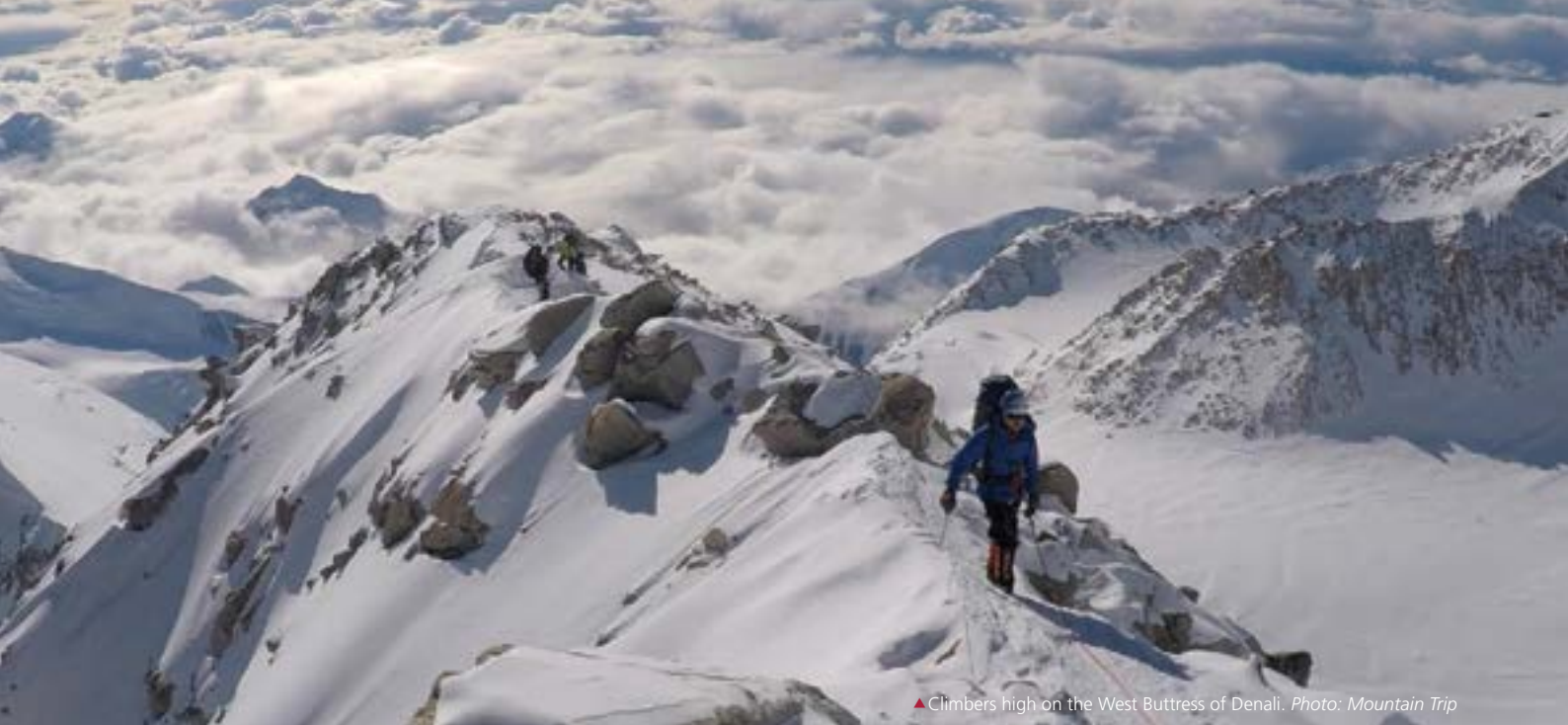
▲ Climbers high on the West Buttress of Denali.