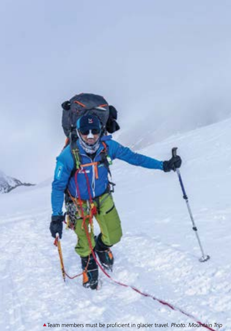
▲ Team members must be proficient in glacier travel.