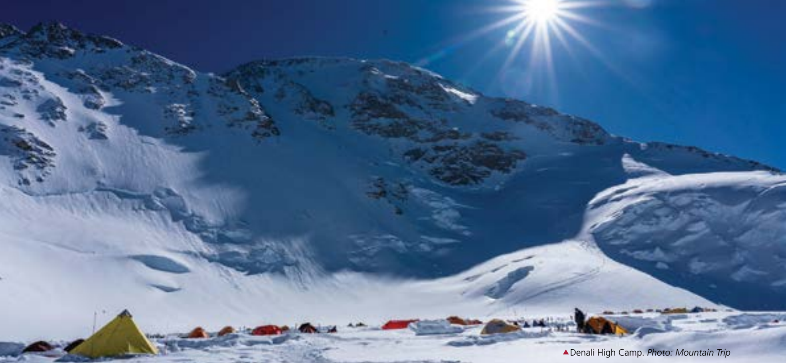
▲ Denali High Camp.