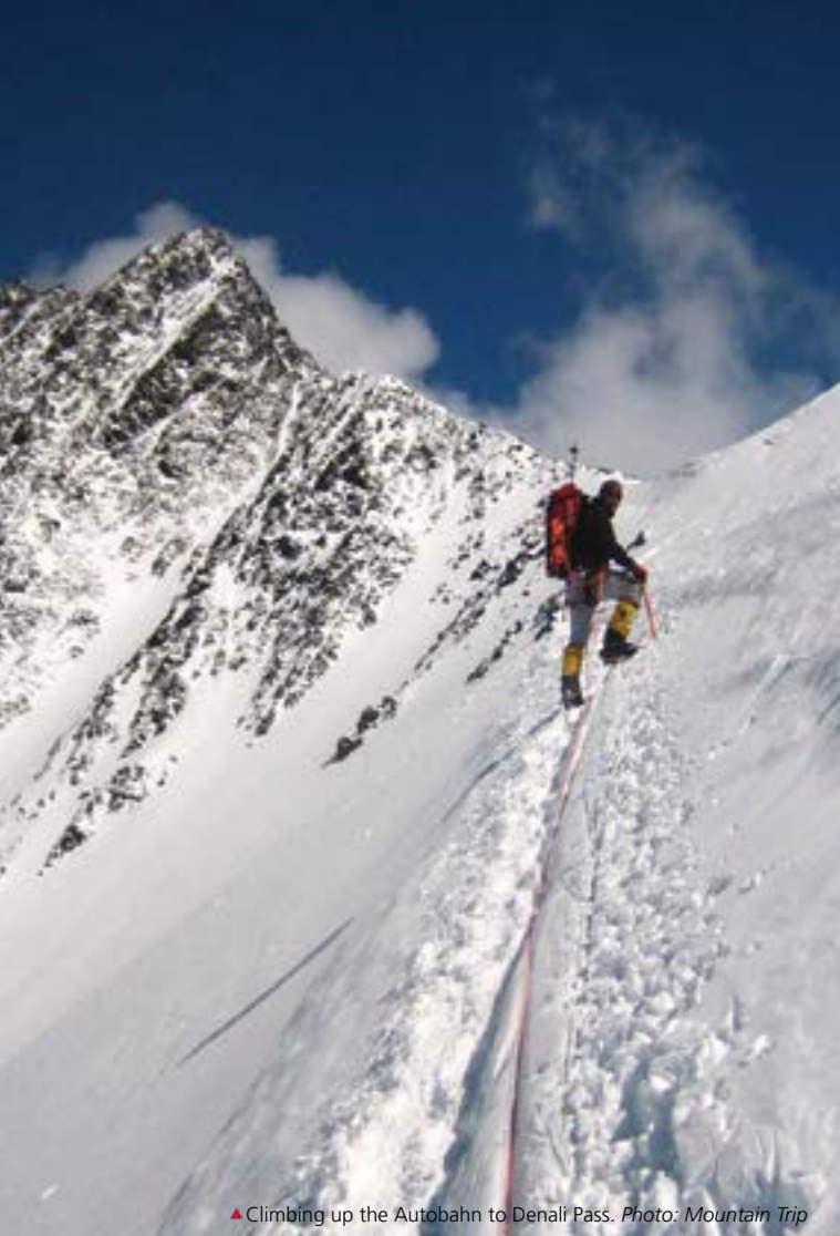
▲ Climbing up the Autobahn to Denali Pass.