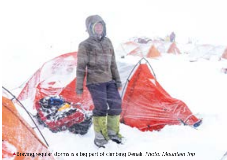
▲ Braving regular storms is a big part of climbing Denali.