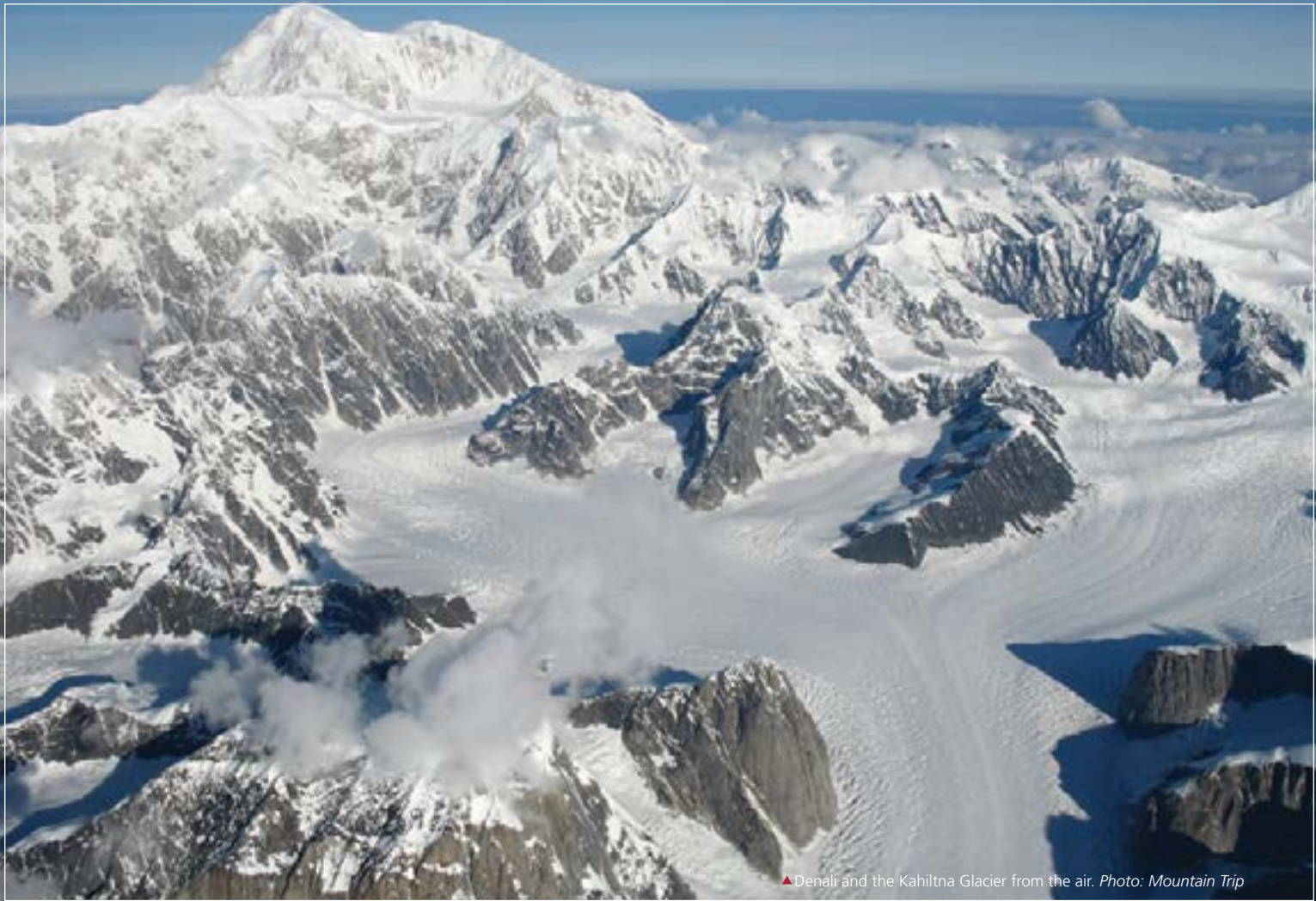
▲ Denali and the Kahiltna Glacier from the air.