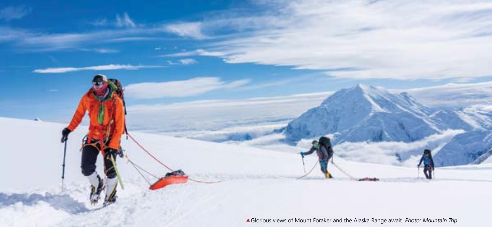
▲ Glorious views of Mount Foraker and the Alaska Range await.

present. The summit is never a guarantee, as Denali can experience very extreme weather conditions with very cold temperatures and high winds. Storms can last a week or more, but the days can also be quite hot and clear with the long Alaskan daylight hours in the summer.