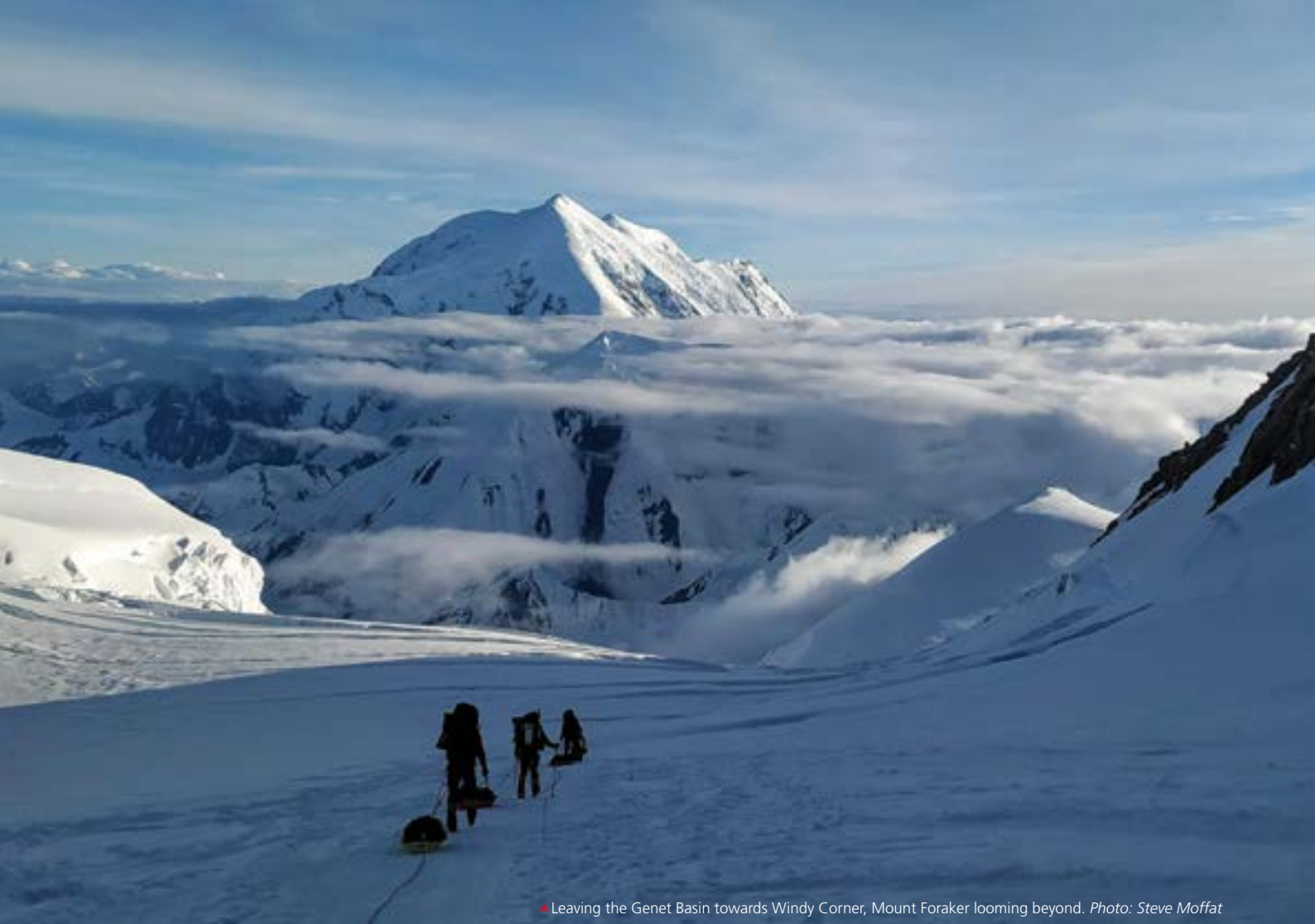
▲ Leaving the Genet Basin towards Windy Corner, Mount Foraker looming beyond.