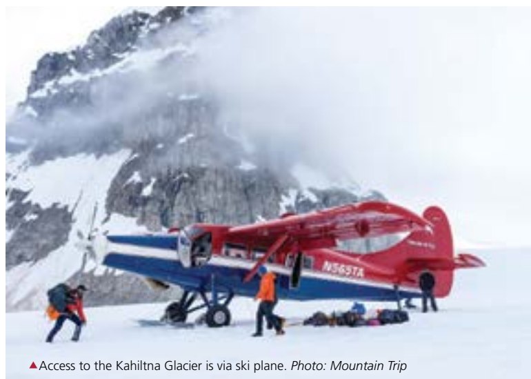
▲ Access to the Kahiltna Glacier is via ski plane.