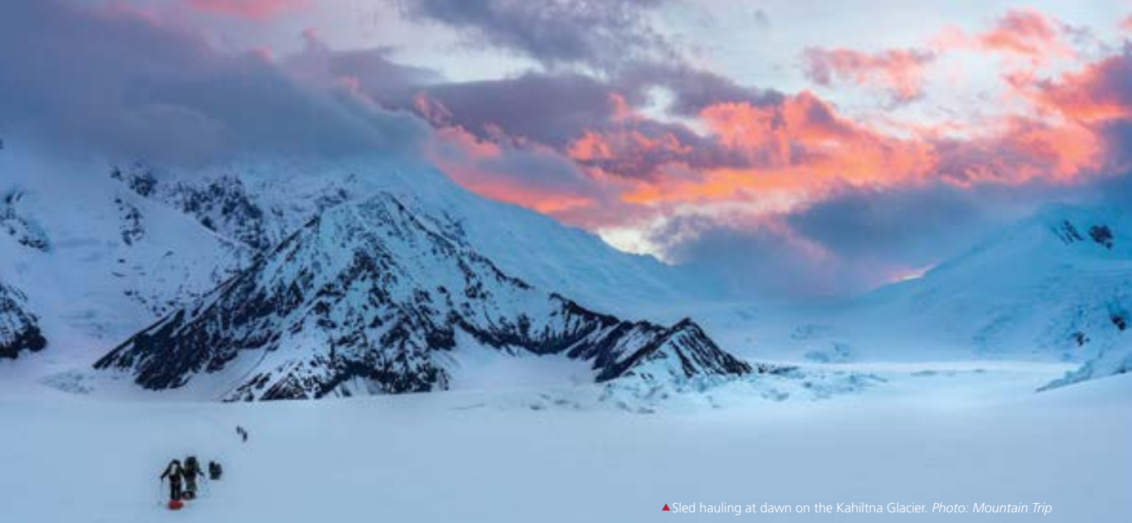
▲ Sled hauling at dawn on the Kahiltna Glacier.