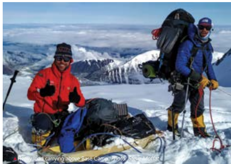
▲ Heavy load carrying above Base Camp.

We will provide group transportation back to Anchorage and assist in making any necessary lodging reservations; however, lodging expenses after the climb are your responsibility. As we cannot predict when we will come off the mountain, we cannot arrange lodging ahead of time. This is a true transition day from the intensity of the mountain to the relative "big city" life of Anchorage.