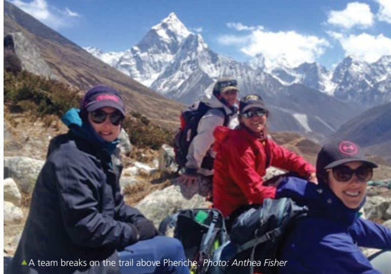
▲ A team breaks on the trail above Pheriche.