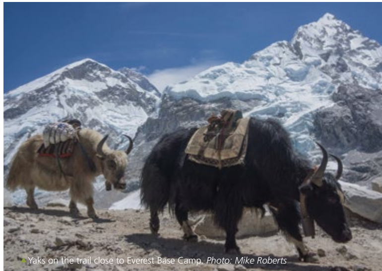
▲ Yaks on the trail close to Everest Base Camp.

The trek fee does not include the following: