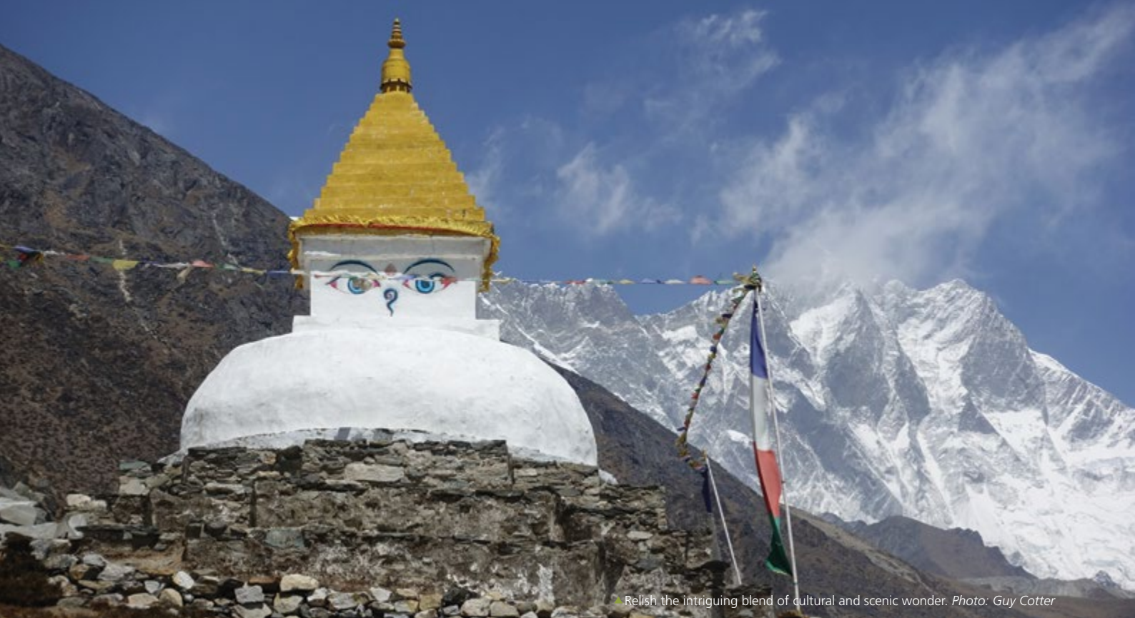
Relish the intriguing blend of cultural and scenic wonder.