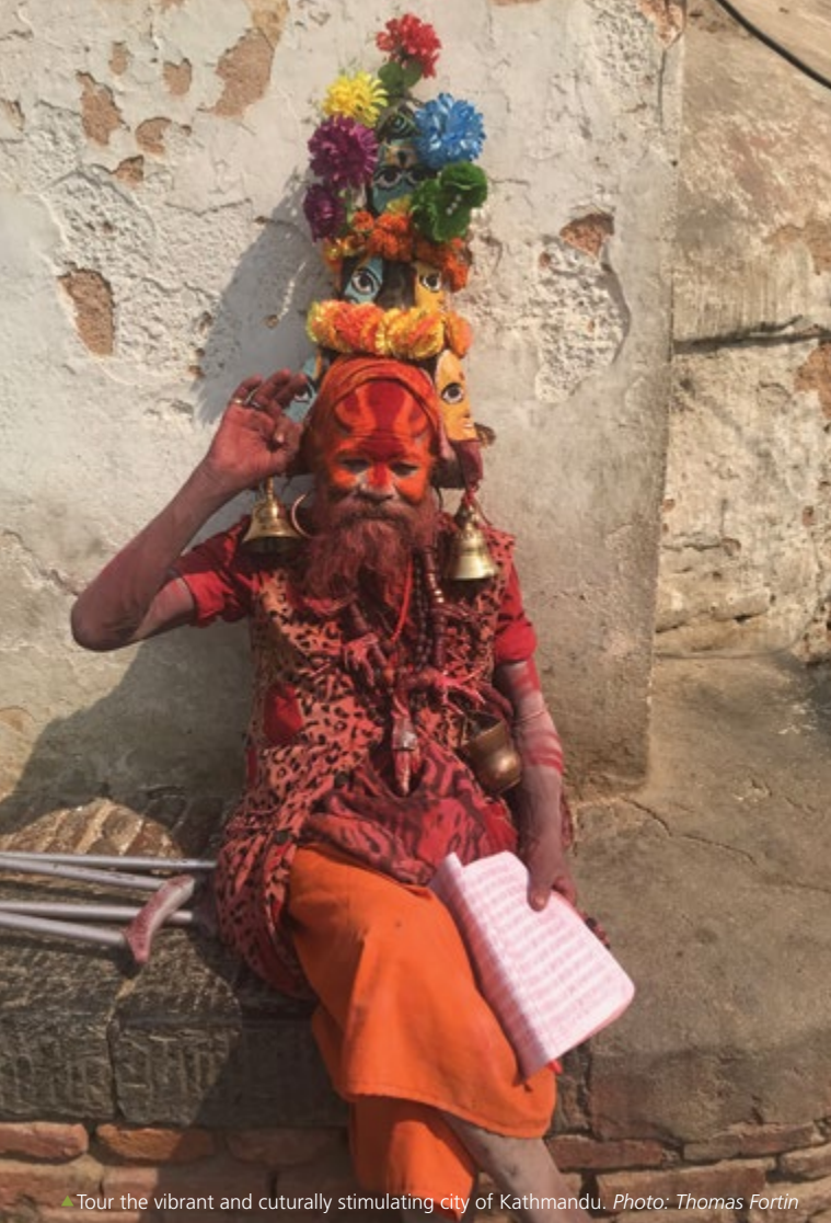
Tour the vibrant and culturally stimulating city of Kathmandu.