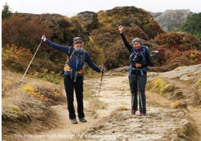
Trek time worn trails through the Khumbu Valley.

There is also the option to extend the trip by including a side trip to the Gokyo Valley.