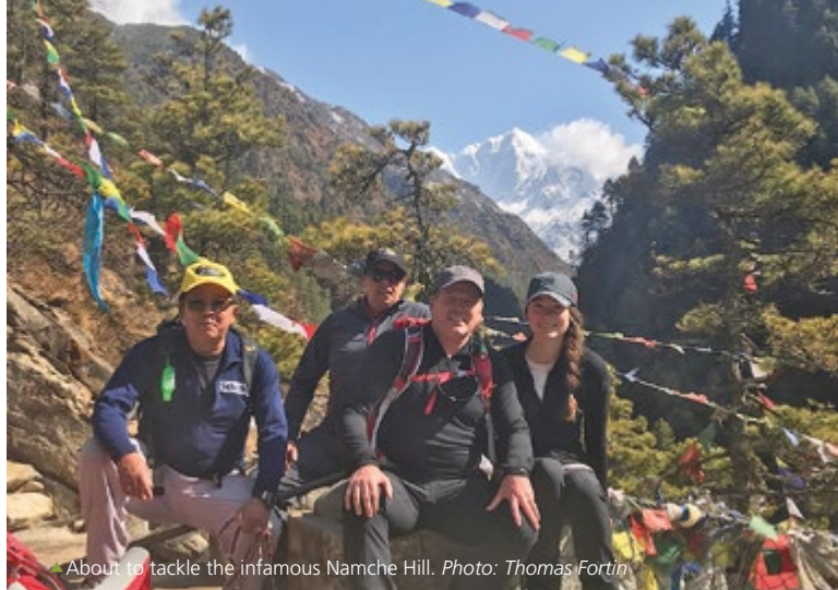
About to tackle the infamous Namche Hill.