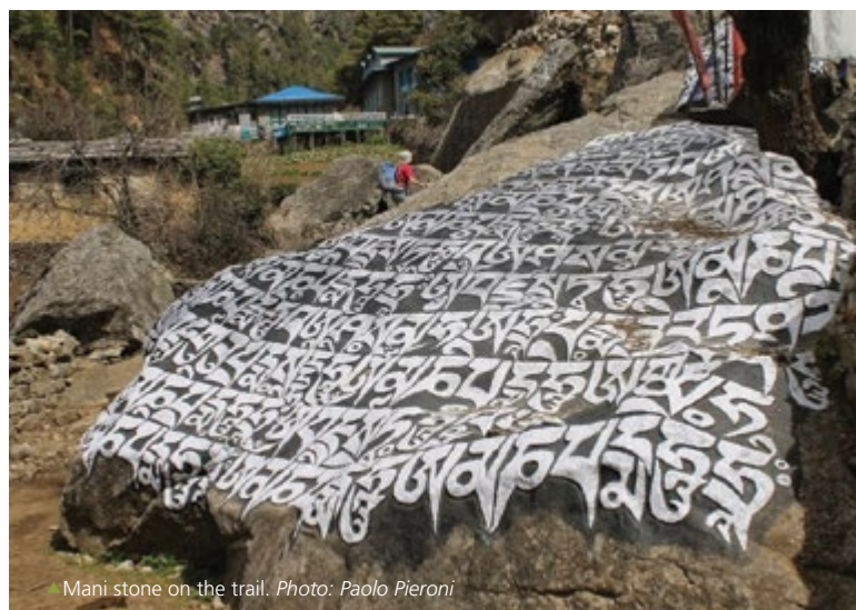
▲ Mani stone on the trail.

There are many sights to delight in Namche Bazaar with dramatic views across the valley to Mount Kwonde, a wonderful backdrop to the unique Sherpa architecture of the houses and lodges here. On our rest day, we explore the local Sherpa Museum and bustling Namche markets, or for those feeling energetic there is the possibility of a hike to visit to Sir Edmund Hillary's first hospital in Nepal, which is situated in the village of Kunde and sample high altitude croissants at the bakery in Khumjung.