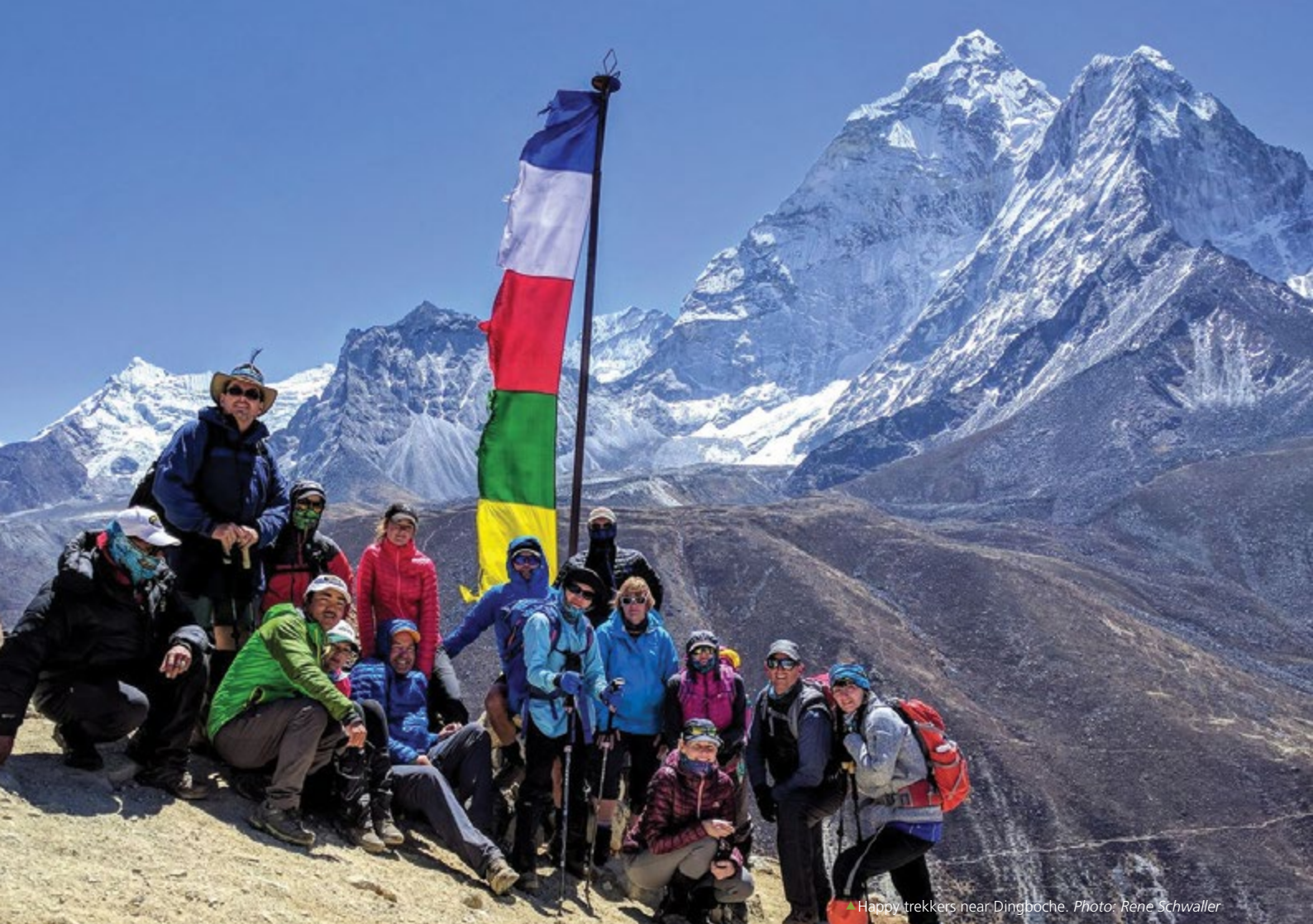
▲ Happy trekkers near Dingboche.

The following morning, we descend to Gorak Shep, located in the shadow of Kala Patar, which is a real highlight of a trek up the Khumbu. At sunrise and sunset, the views of Everest can be magical, and we'll make the climb in the hope of enjoying a photographic session from the summit!