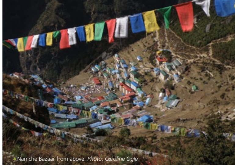
▲ Namche Bazaar from above.