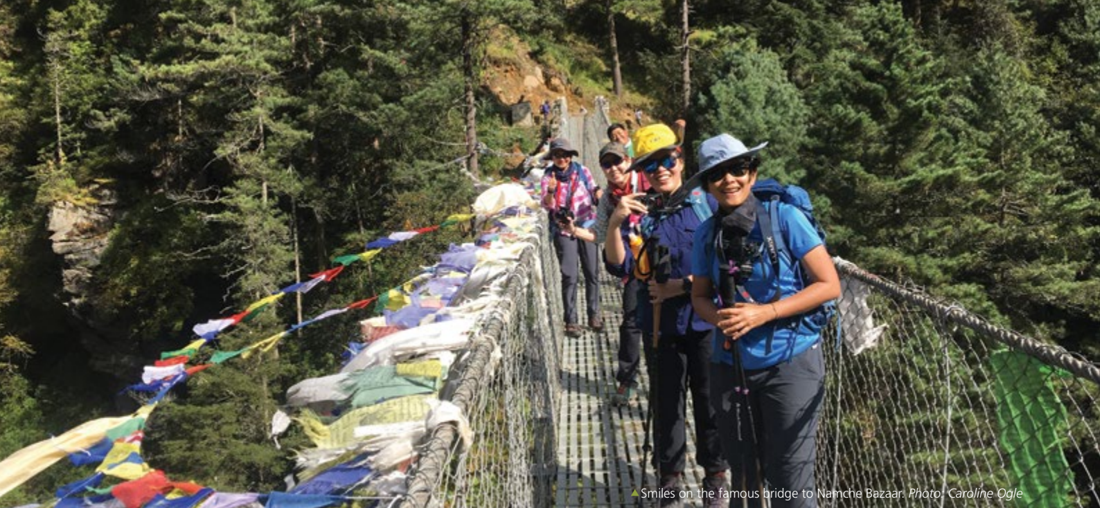
▲ Smiles on the famous bridge to Namche Bazaar.

Day 4 Trek to Namche Bazaar (3,440m/11,286ft)