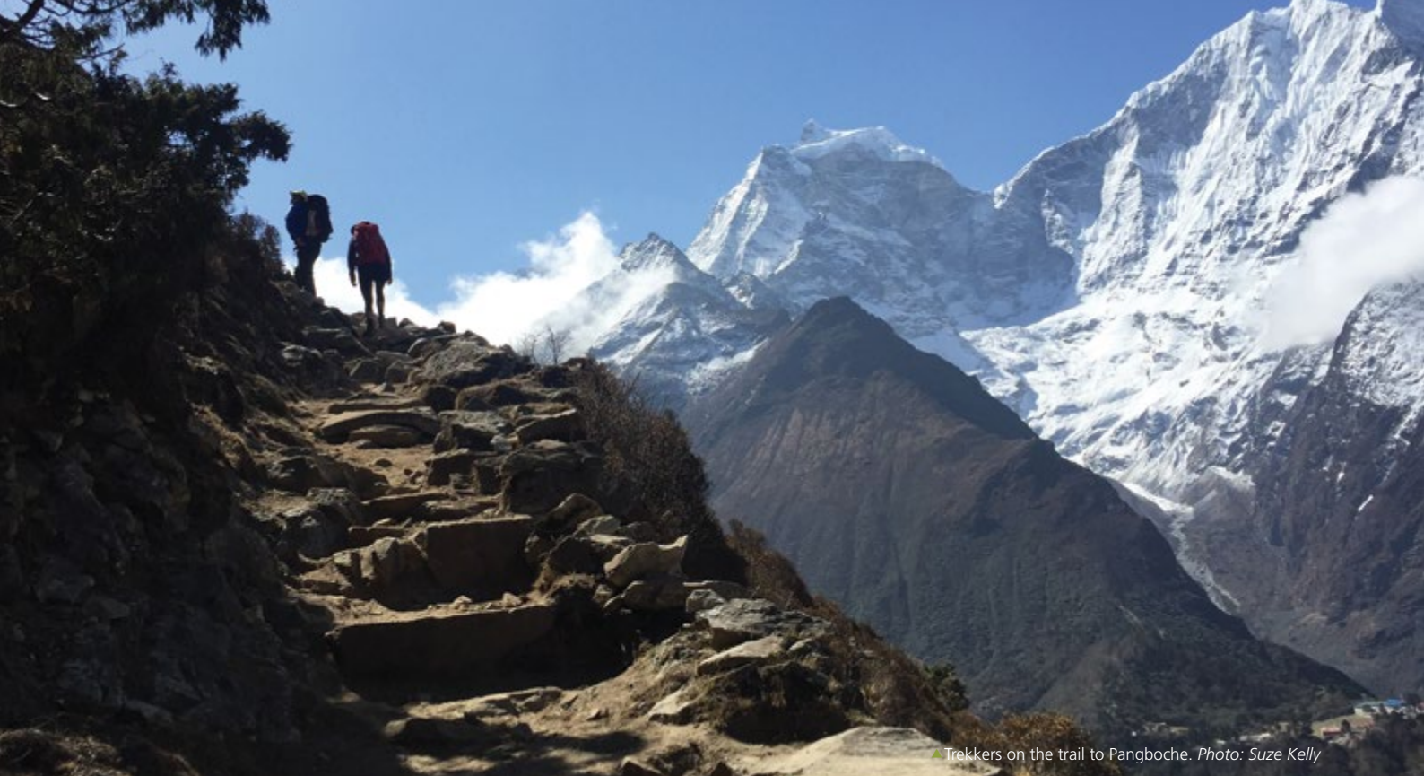
▲ Trekkers on the trail to Pangboche.

If you are travelling alone or if there are just 2–3 of you, then you will need to join our main departures from Kathmandu on April 1, April 18 or October 1 or, alternatively, one of our Luxury Everest Base Camp Trek departures.