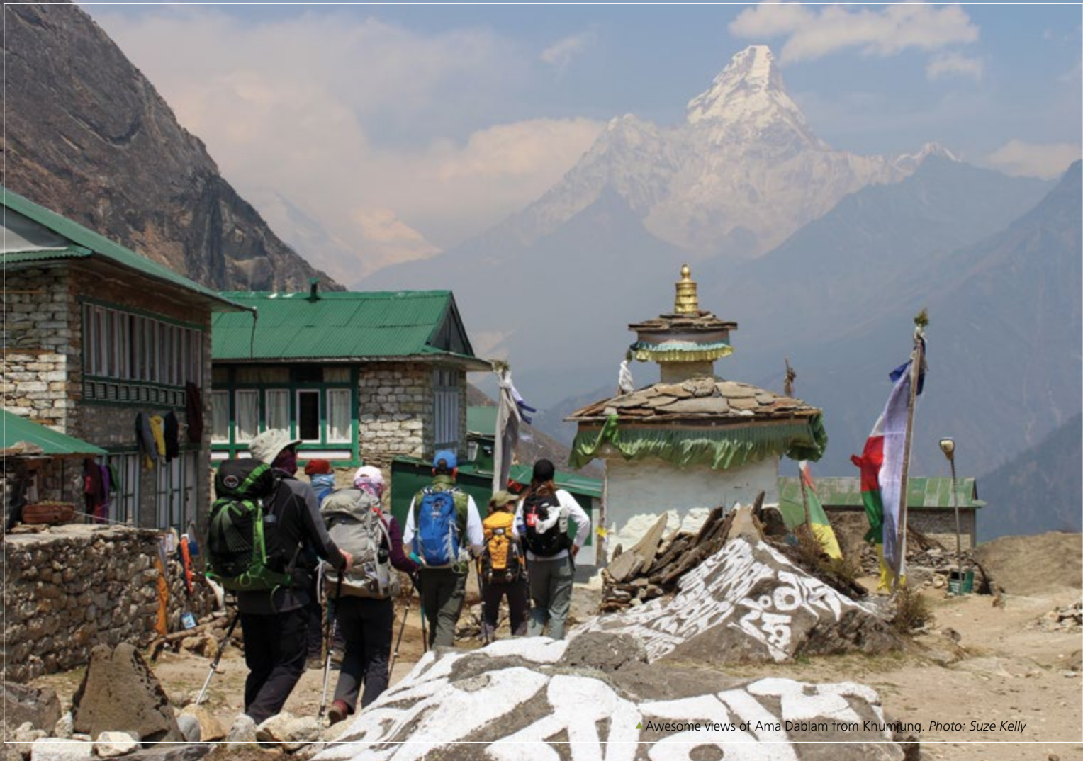
▲ Awesome views of Ama Dablam from Khumjung.