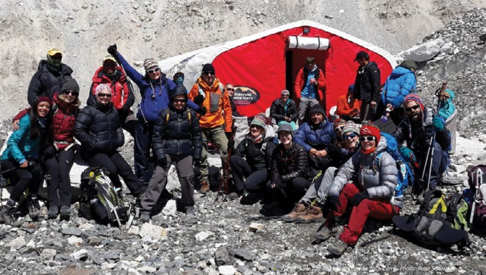
▲ "We've made it!" Trekkers at Everest Base Camp.