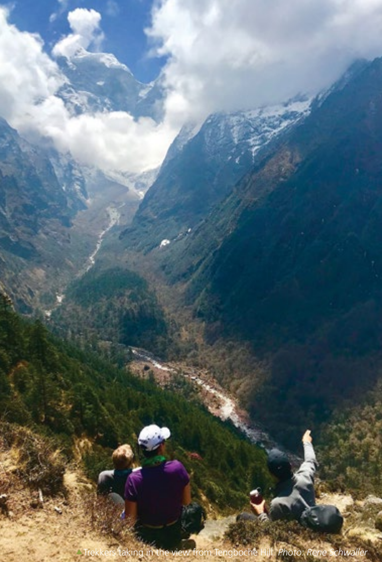
▲ Trekkers taking in the view from Tengboché Hill.