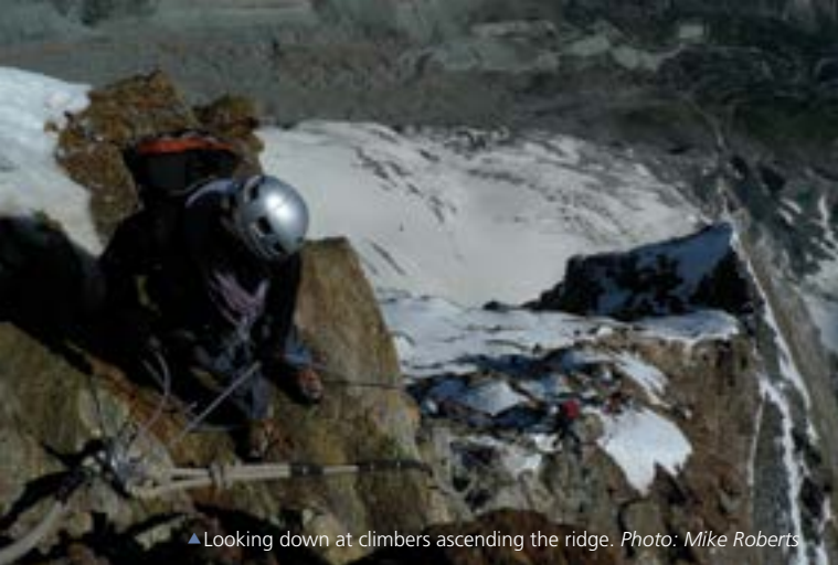
▲ Looking down at climbers ascending the ridge.