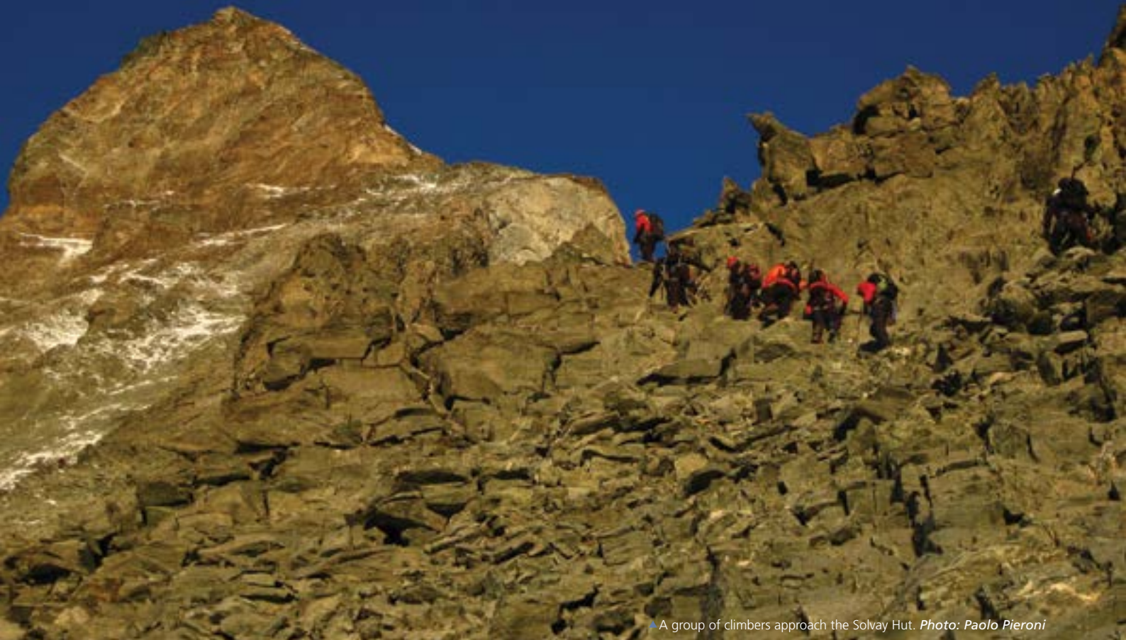
◆ A group of climbers approach the Solvay Hut.