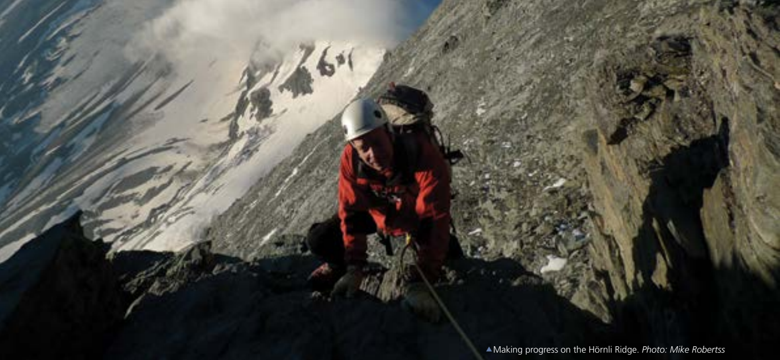
▲ Making progress on the Hörnli Ridge.

the Matterhorn programme begins, you experience more enjoyment from the climb and enjoy a greater success rate.