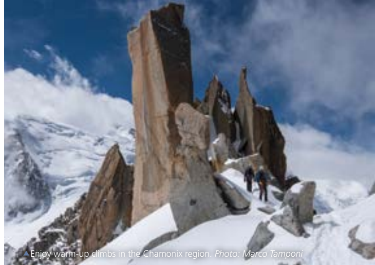
▲ Enjoy warm-up climbs in the Chamonix region.