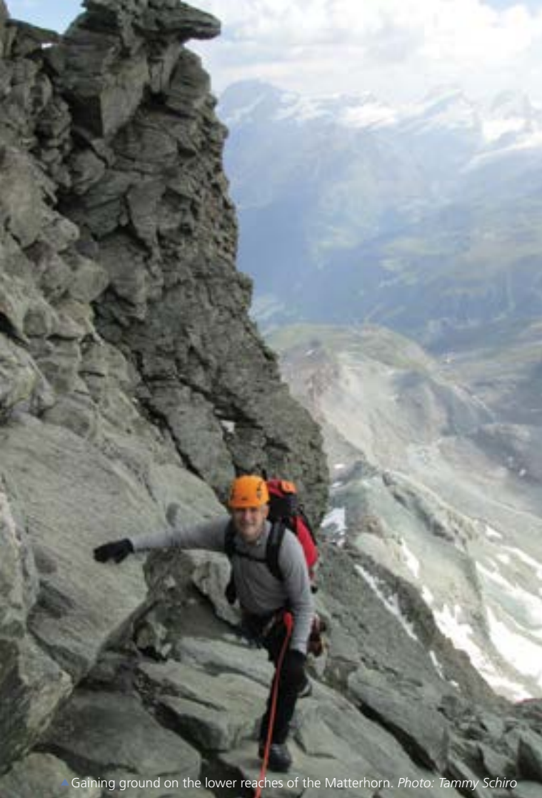
▲ Gaining ground on the lower reaches of the Matterhorn.