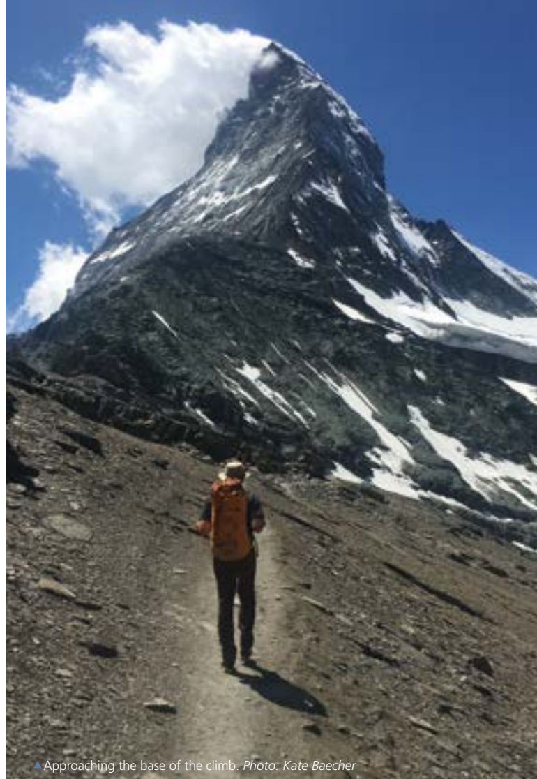
▲ Approaching the base of the climb.