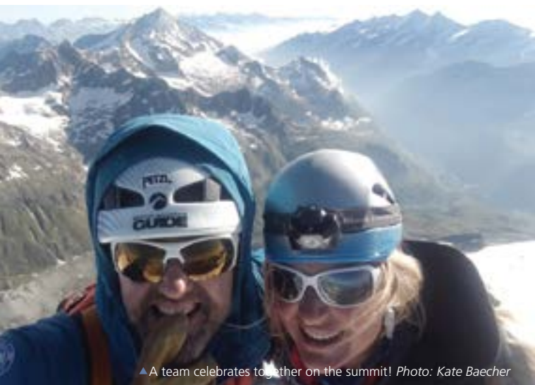
▲ A team celebrates together on the summit!