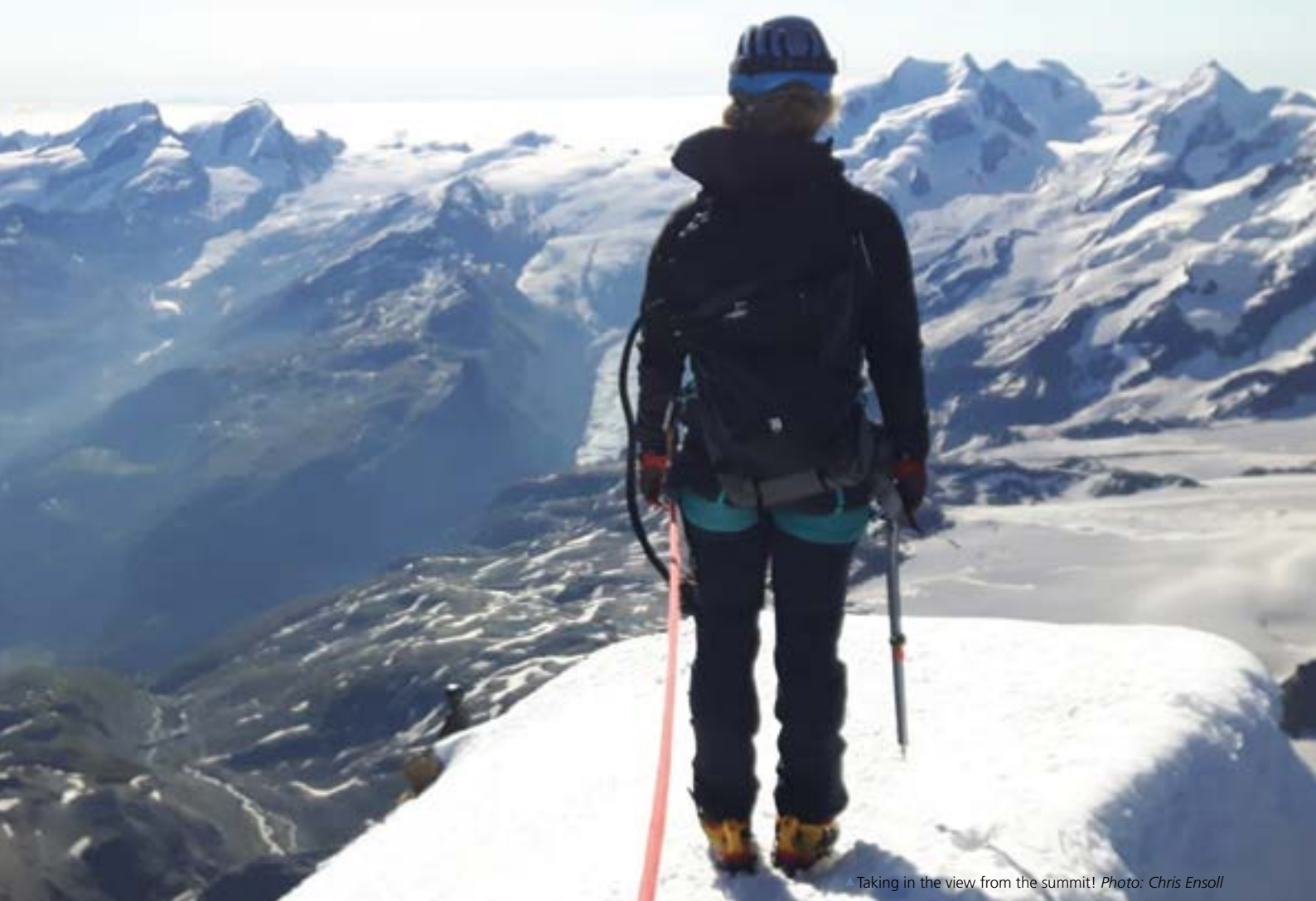
▲ Taking in the view from the summit!