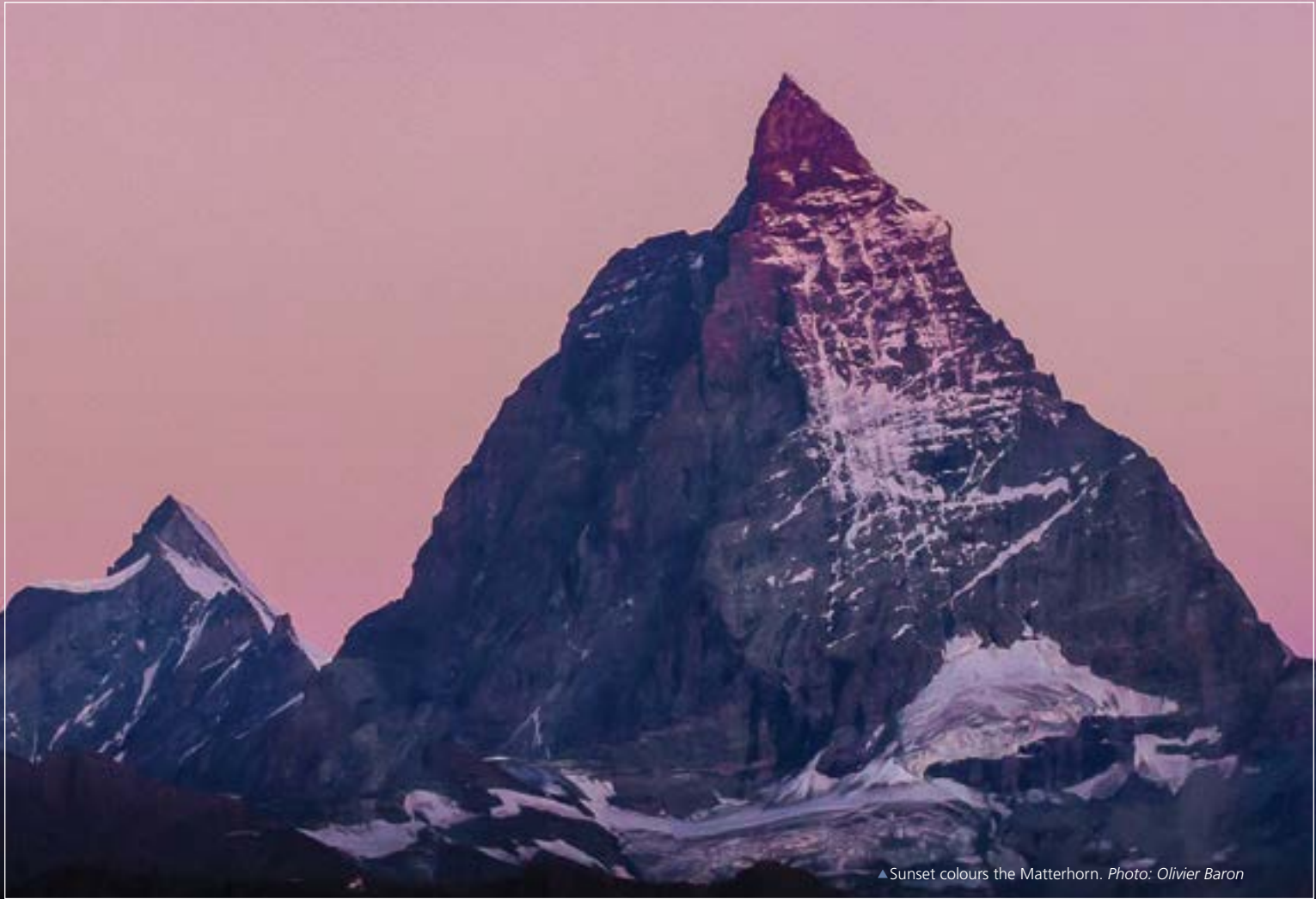
▲Sunset colours the Matterhorn.