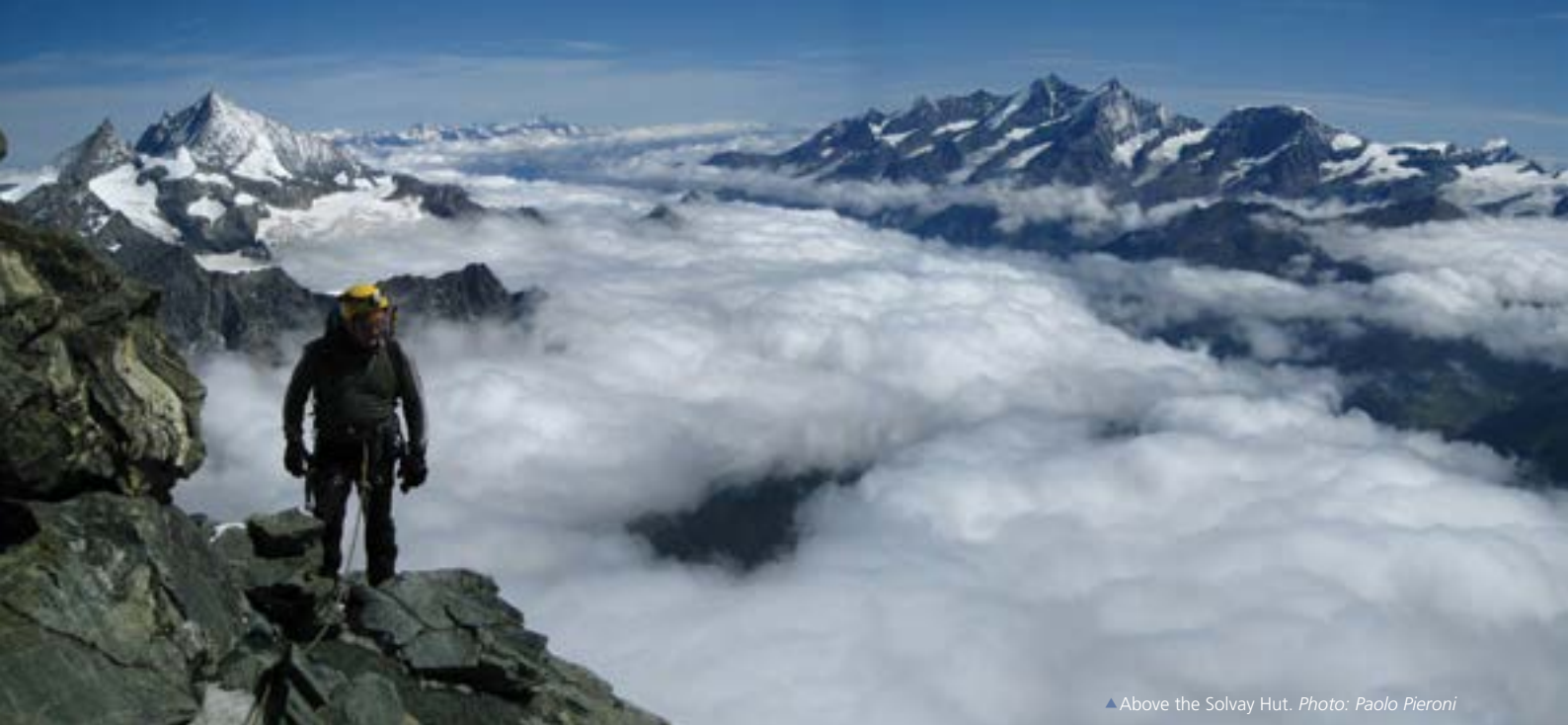
▲ Above the Solvay Hut.

backup. Your own mobile phone should work in the region, although you may want to check with your own service provider first. Local mobile phones can be rented at the international airports.