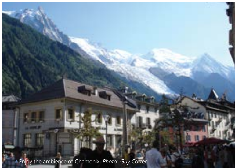
▲ Enjoy the ambience of Chamonix.