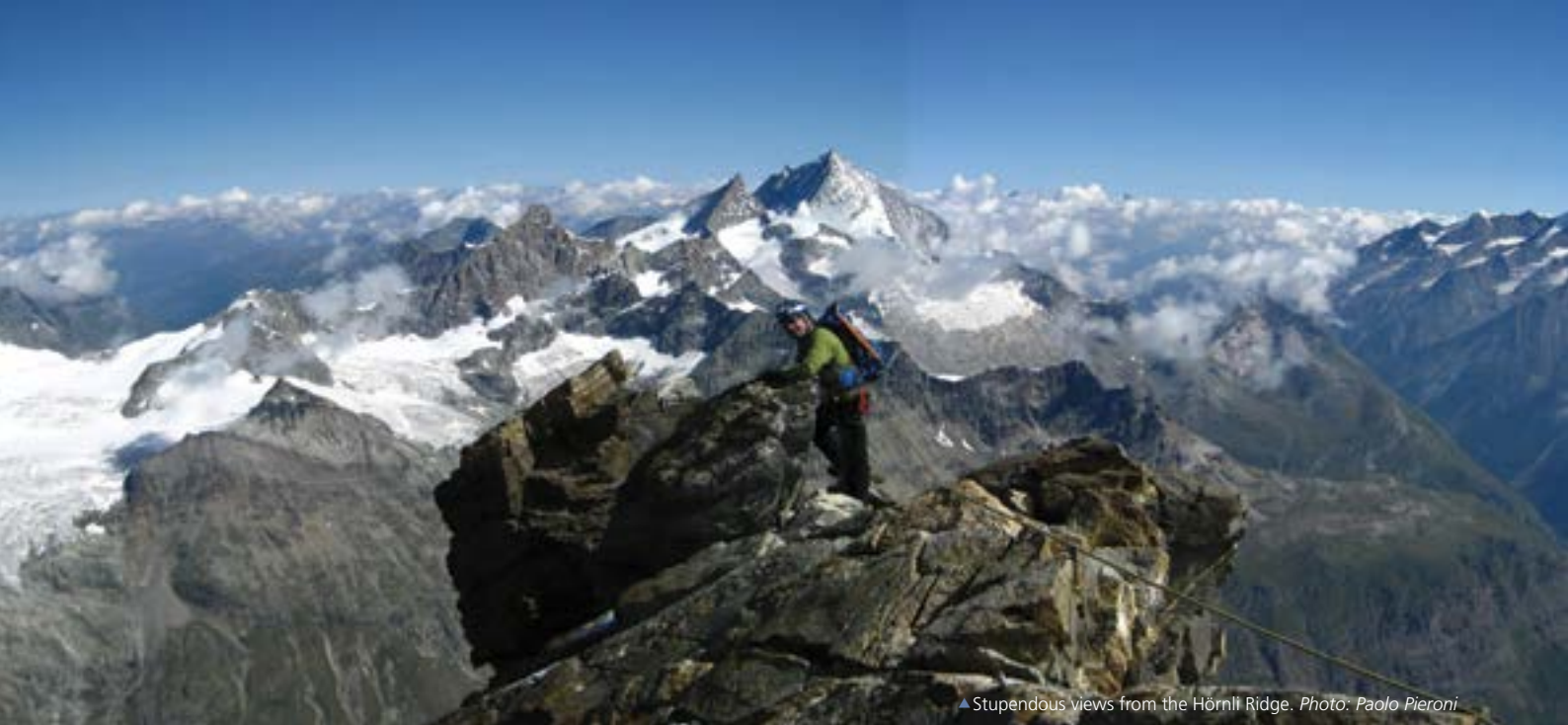
▲ Stupendous views from the Hörnli Ridge.

The summit day will start well before dawn, around 3am, and you will be encouraged by your guide to move consistently to ensure you reach the summit in a reasonable timeframe. Depending on conditions, the ascent will take between 4–6 hours and an equal length of time to descend.