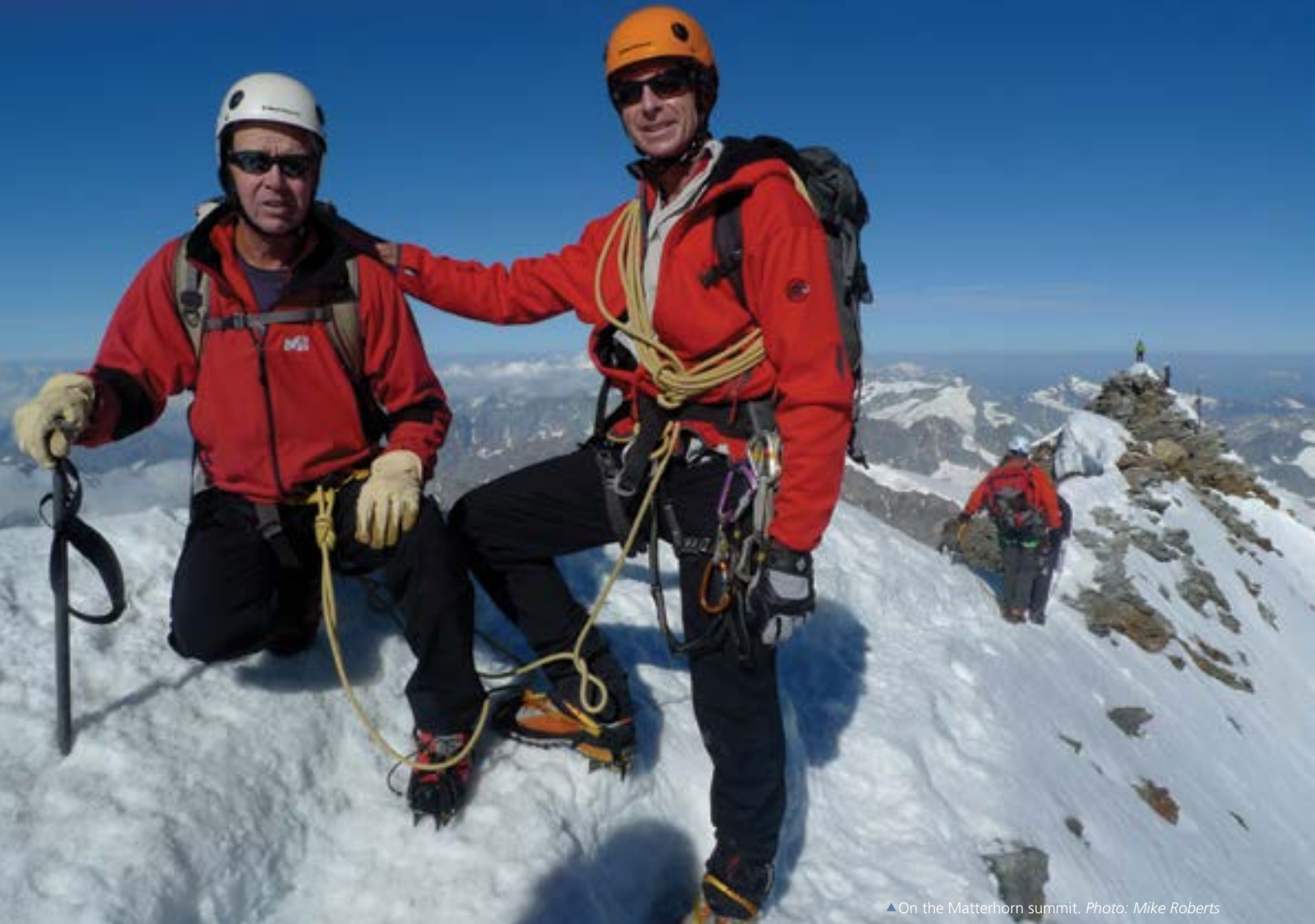
▲ On the Matterhorn summit.