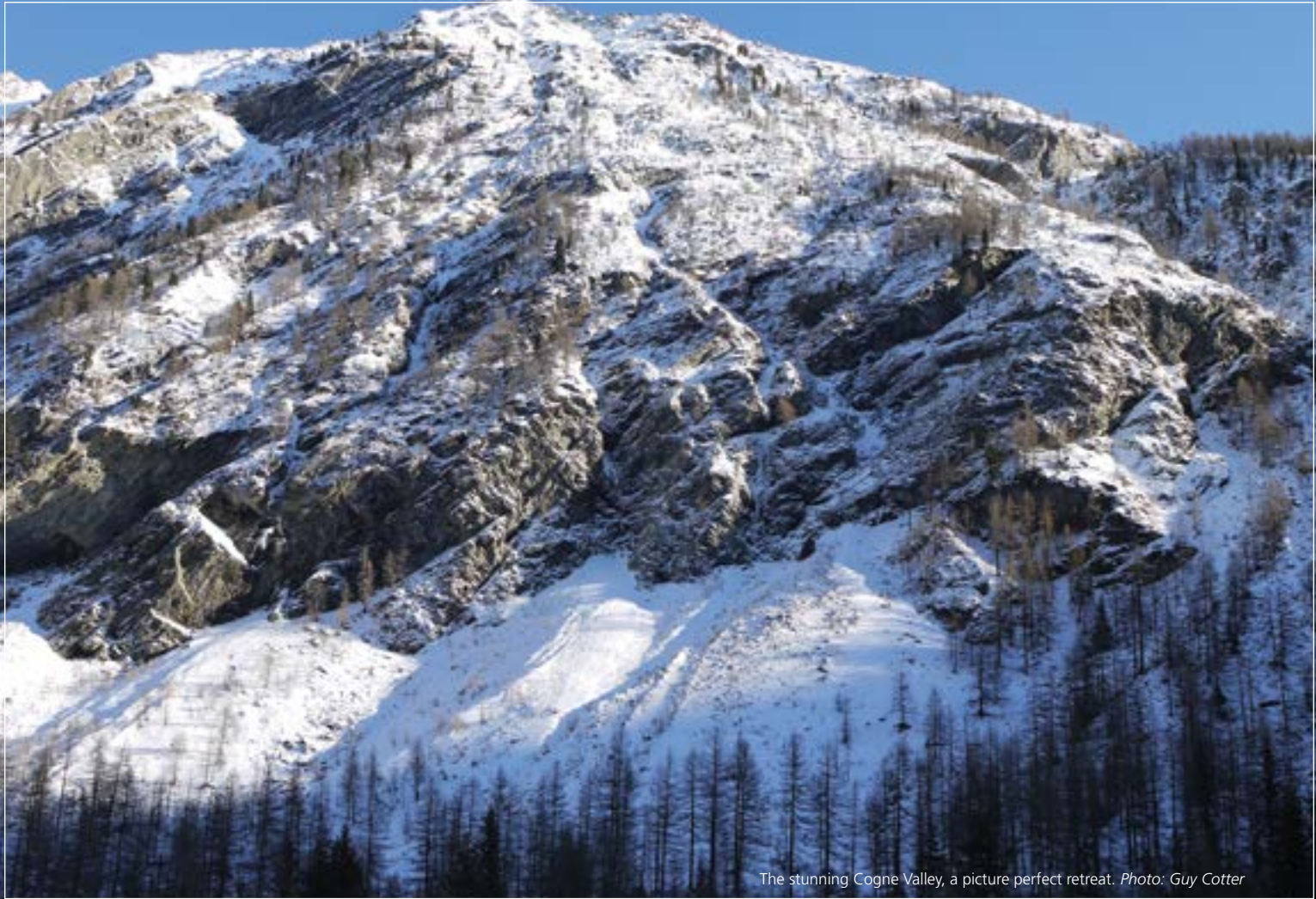
The stunning Cogne Valley, a picture perfect retreat.