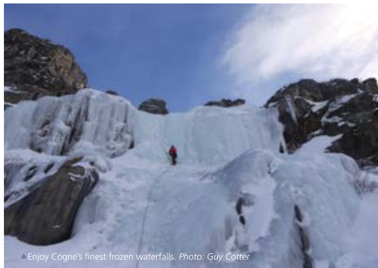
▲ Enjoy Cogne's finest frozen waterfalls.

back to the airport. The shuttle transfers are at your own cost but we can arrange this for you.