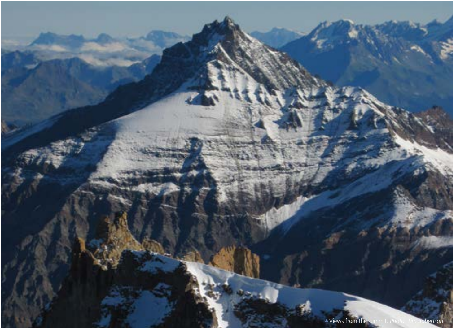
▲ Views from the summit.