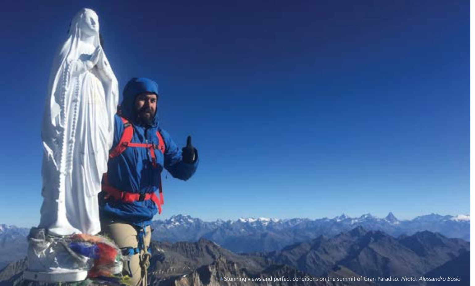
Stunning views and perfect conditions on the summit of Gran Paradiso.

that even extreme pursuits such as high altitude mountaineering can be undertaken safely.