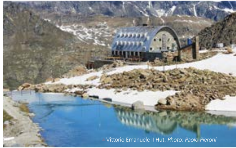
▲ Vittorio Emanuele II Hut.