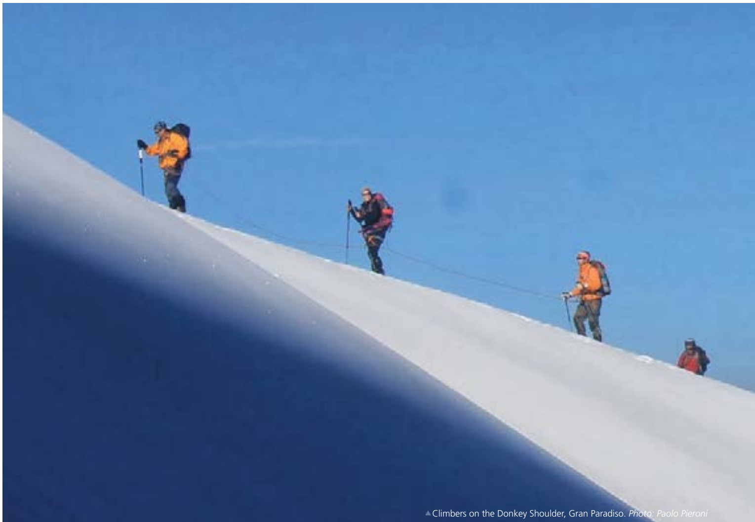
▲ Climbers on the Donkey Shoulder, Gran Paradiso.