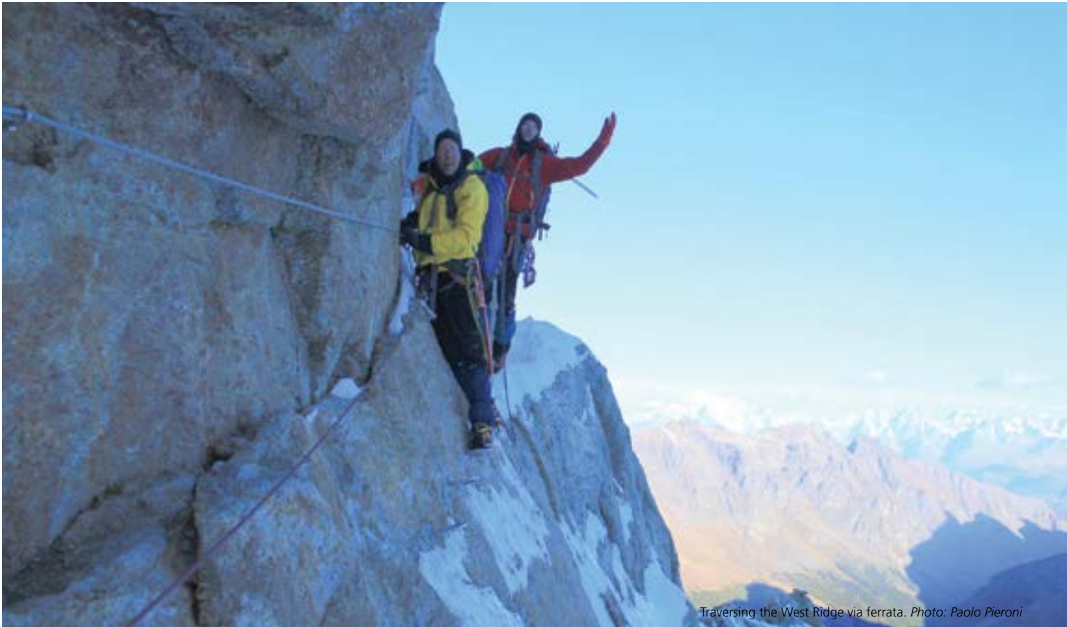
Traversing the West Ridge via ferrata.