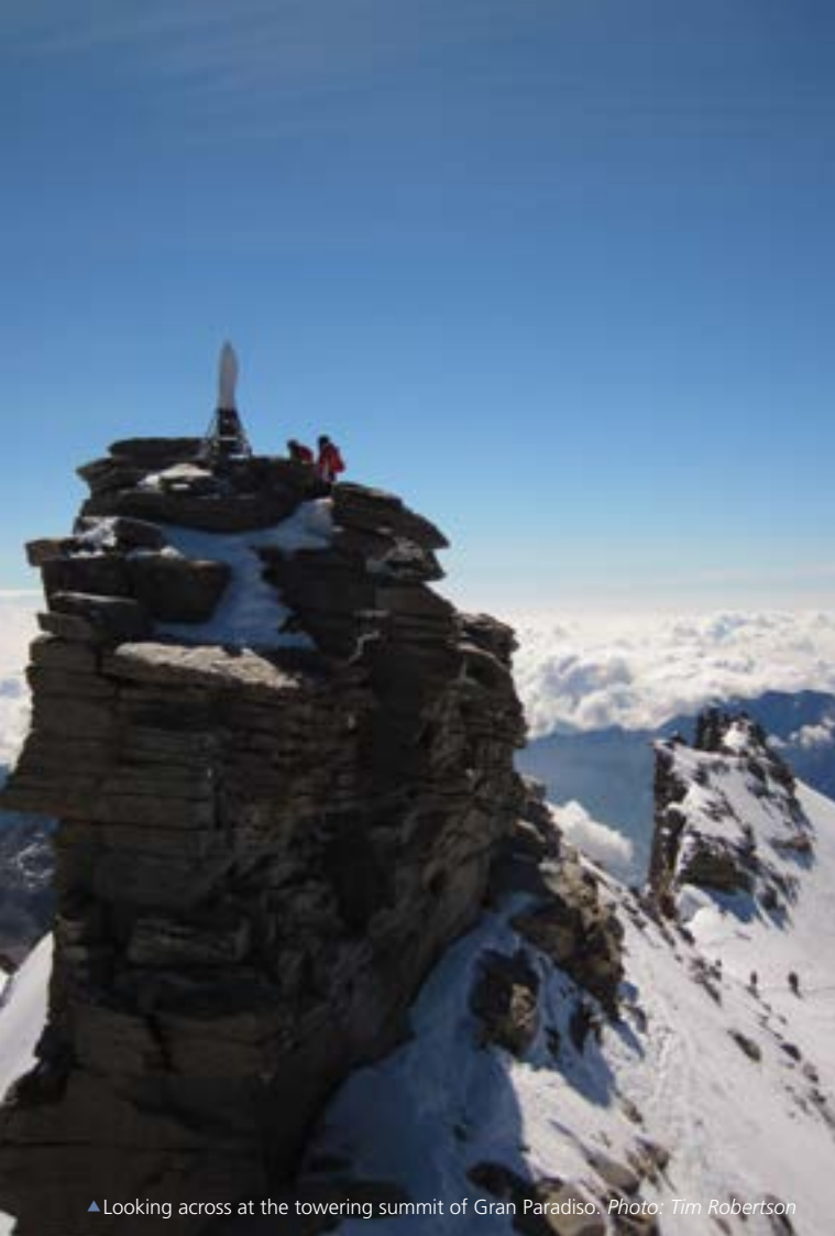
▲ Looking across at the towering summit of Gran Paradiso.