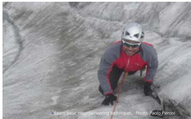
▲ Learn basic mountaineering techniques.