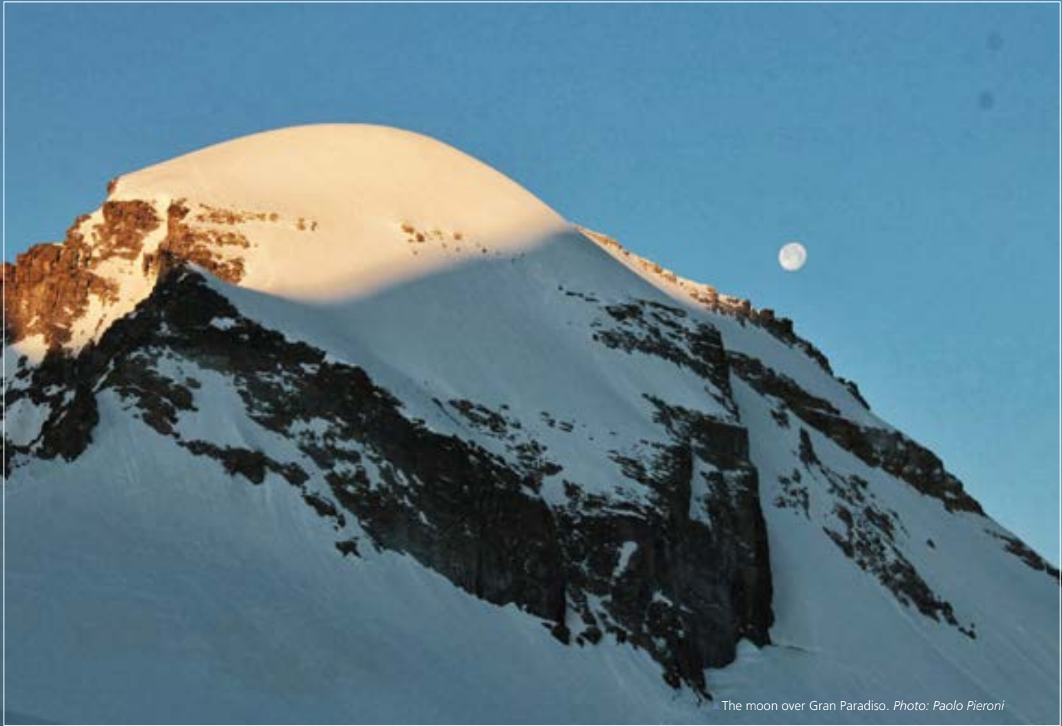
▲ The moon over Gran Paradiso.