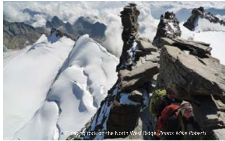
▲ Climbing rock on the North West Ridge.

Our guides are in cell phone communication with our operations base throughout the trip. This assists us with schedule and weather forecast updates, lift and accommodation co-ordination and safety backup. Your own mobile phone should work in the region though you may wish to check with your service provider first. Local mobile phones can be rented at the international airports.