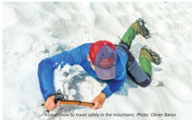
▲ Learn how to travel safely in the mountains.