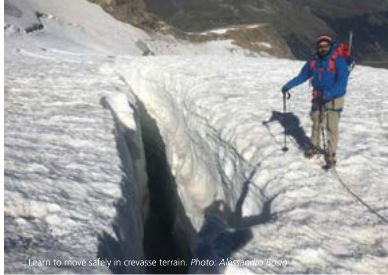
Learn to move safely in crevasse terrain.