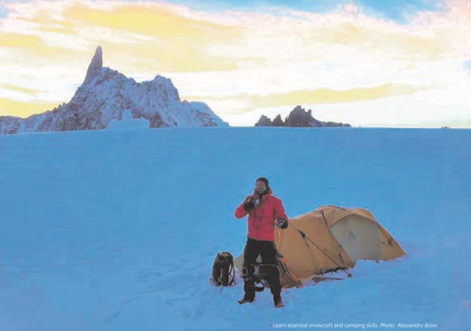
▲ Learn essential snowcraft and camping skills.

programme begins, you experience more enjoyment from the climbs and enjoy a greater success rate.