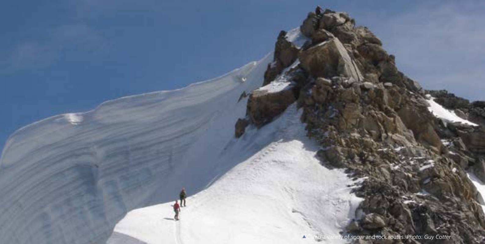
▲ Climb a variety of snow and rock routes.