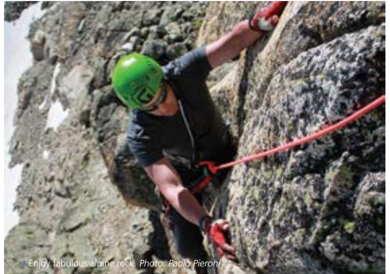
Enjoy fabulous alpine rock.