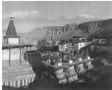
Monastery in Mustang region

stricted area with only small numbers of tourists given access every year.