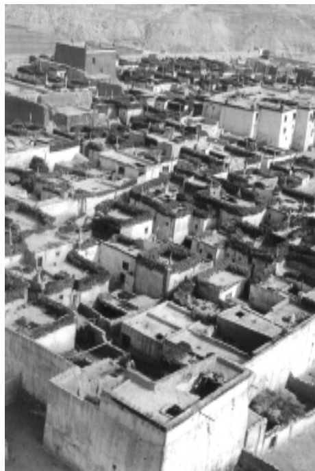
Lo Montang, Mustang

The Mustang region of Nepal is often referred to as 'The Forbidden Kingdom of Nepal'. This stark and barren area of the middle Himalayas holds the last remnants of true Tibetan lifestyle untainted by foreign occupation. Whilst being annexed to Nepal, Mustang enjoys its own autonomy and the residents live much the same as they have for centuries. To avoid this unique Kingdom being overrun by tourism the region has been gazetted as a re-